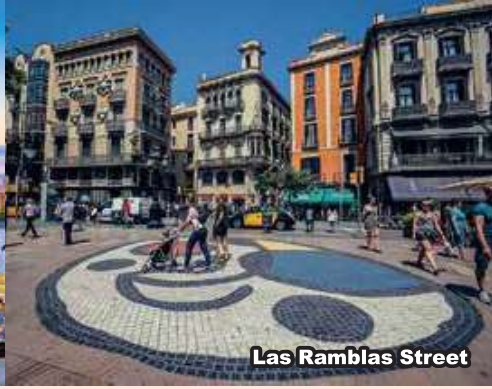
Las Ramblas Street