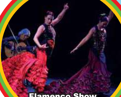
Flamenco Show & Dinner