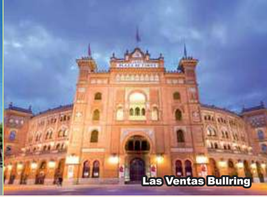
Las Ventas Bullring