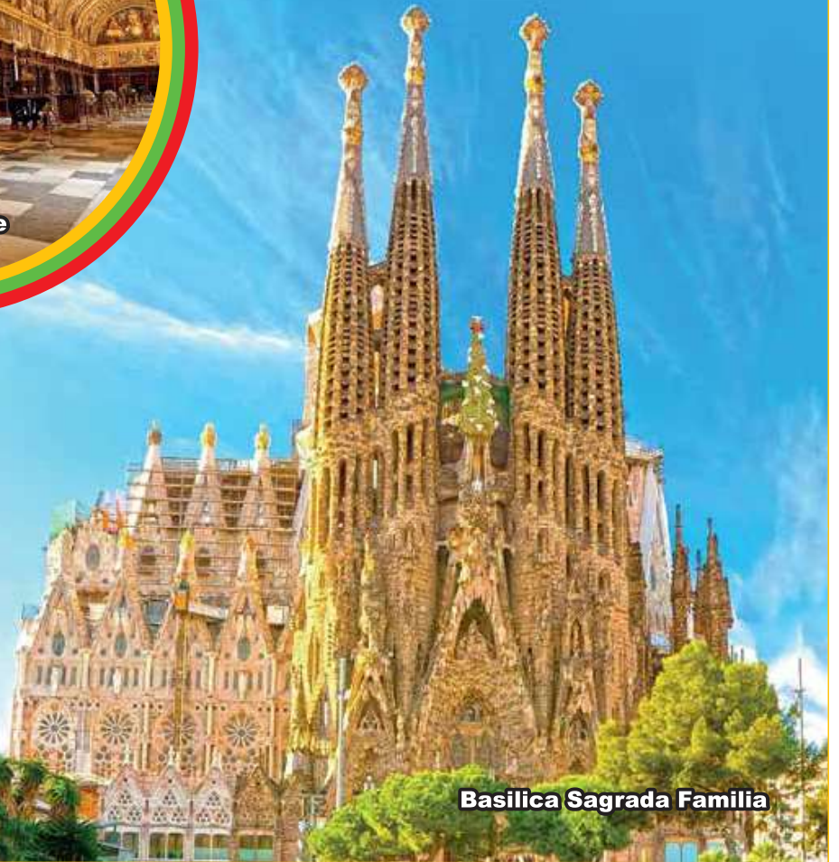
Basilica Sagrada Familia