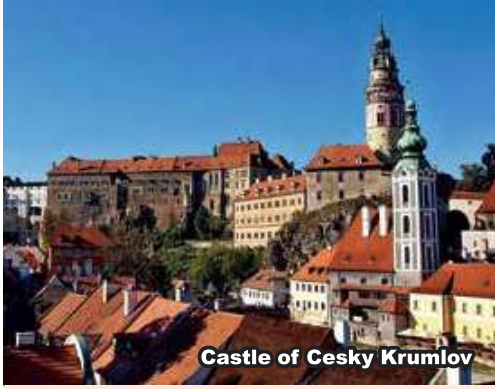
Castle of Cesky Krumlov