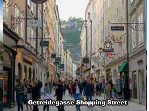
Getreidegasse Shopping Street