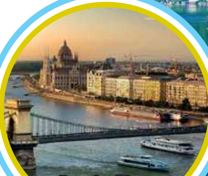
Danube River Cruise