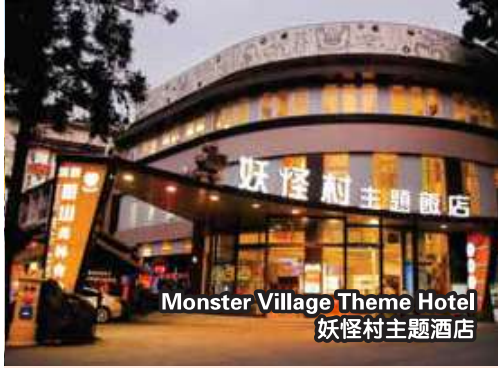
Monster Village Theme Hotel 妖怪村主题酒店