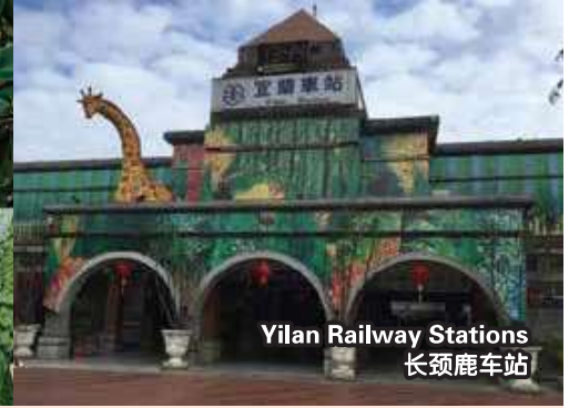
Yilan Railway Stations 长颈鹿车站