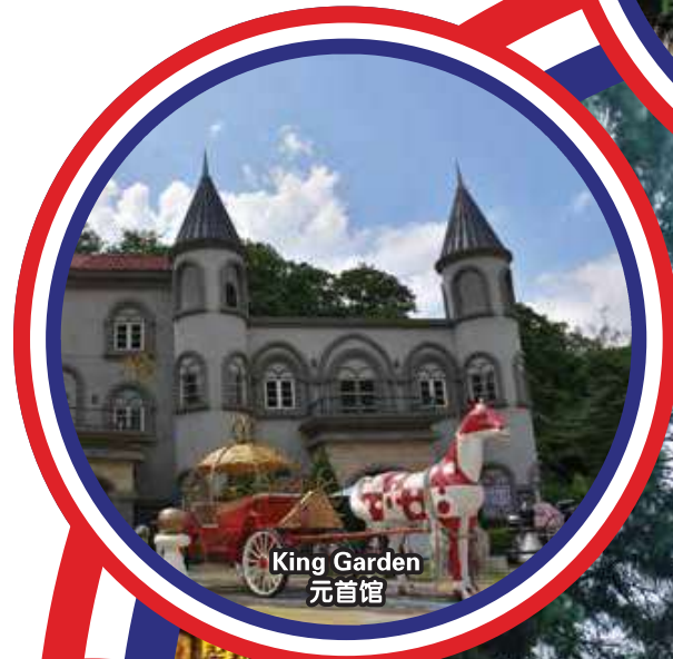
King Garden 元首馆