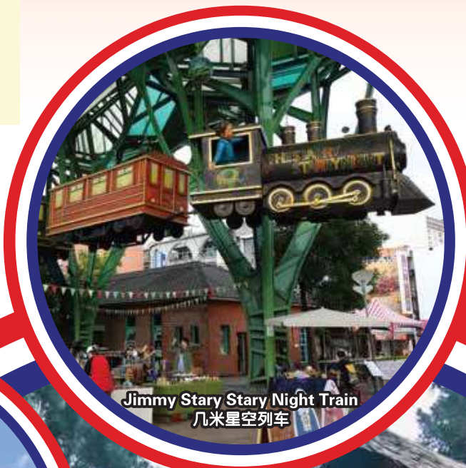
Jimmy Stary Stary Night Train 几米星空列车