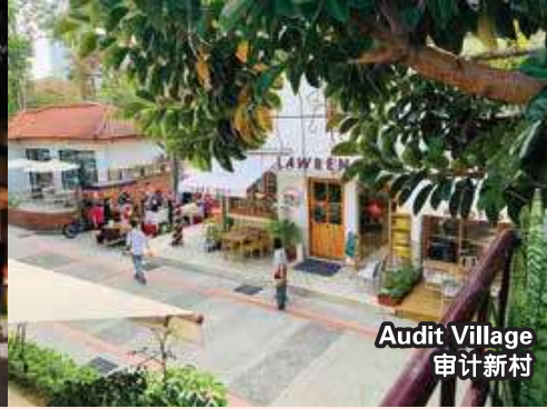
Audit Village 审计新村