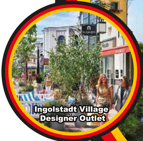
Ingolstadt Village Designer Outlet