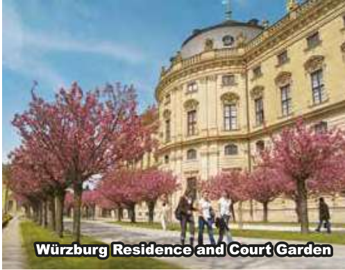
Würzburg Residence and Court Garden