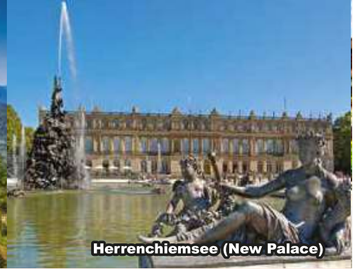
Herrenchiemsee (New Palace)