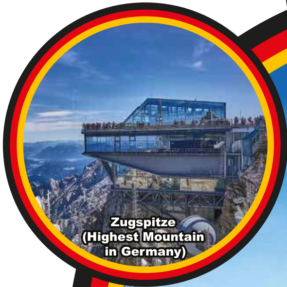
Zugspitze (Highest Mountain in Germany)