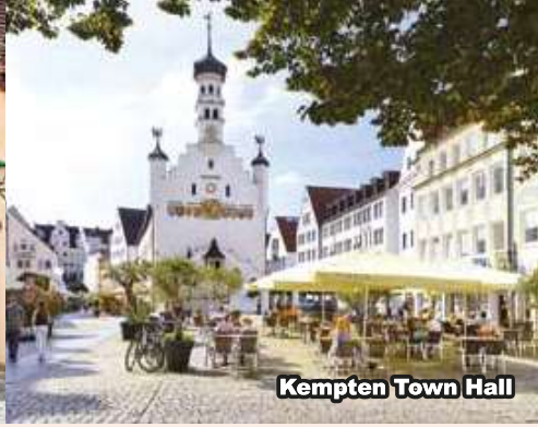
Kempten Town Hall