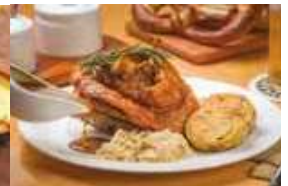
3 Course Meal - German Lunch with Pork Knuckle

Disclaimer: Due to Covid-19 travel restrictions, local / religious festivals, public holidays, weather condition, transport technical issue, acts of nature, Golden Destinations reserved the right to alter the sequence or change, amend or alter the itinerary if necessary, with or without prior notice.