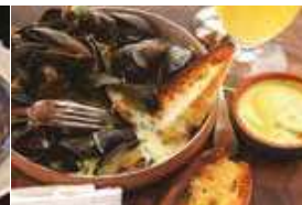
3 Course Meal - Mussels Meals