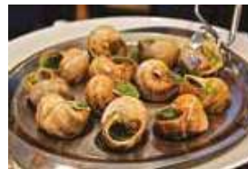
3 Course Meal - French Cuisine with Escargot