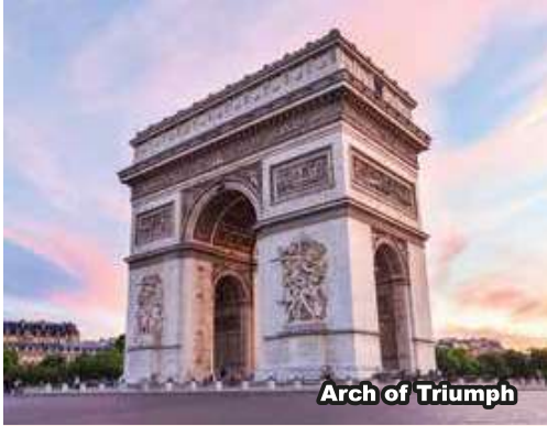
Arch of Triumph