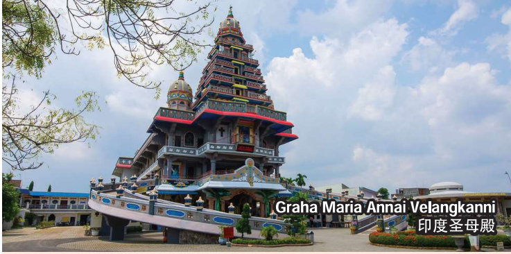
Graha Maria Annai Velangkanni 印度圣母殿