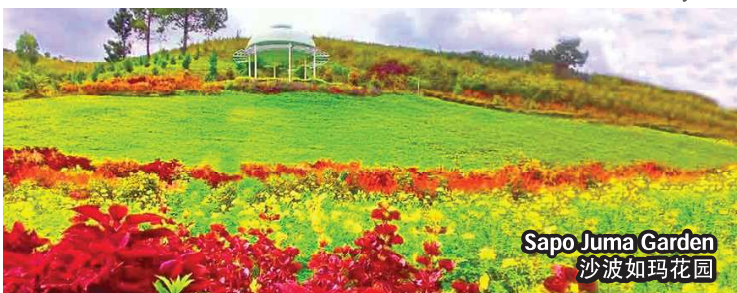
Sapo Juma Garden 沙波如玛花园