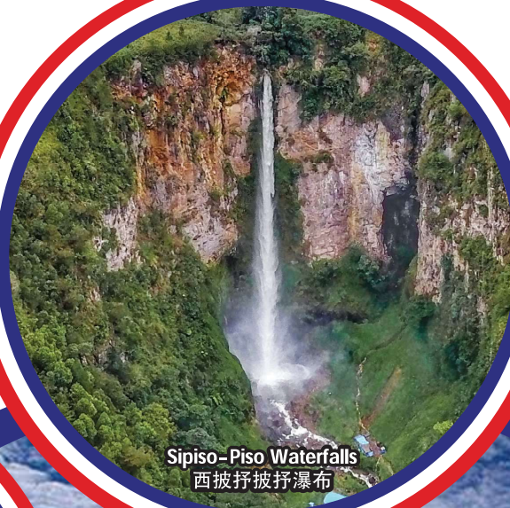
Sipiso-Piso Waterfalls 西披抒披抒瀑布