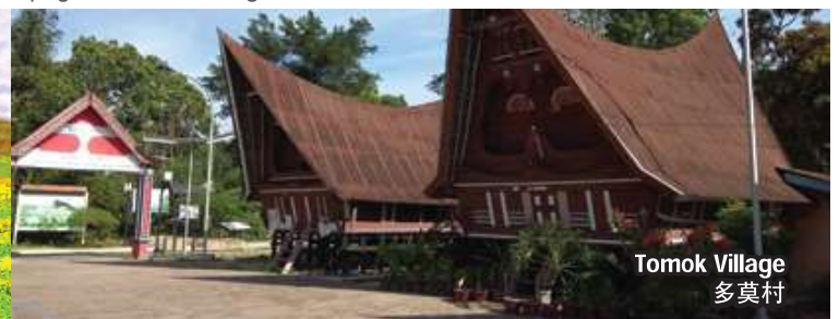
Tomok Village 多莫村

Disclaimer: Due to Covid-19 travel restrictions, local / religious festivals, public holidays, weather condition, transport technical issue, acts of nature, Golden Destinations reserved the right to alter the sequence or change, amend or alter the itinerary if necessary, with or without prior notice.