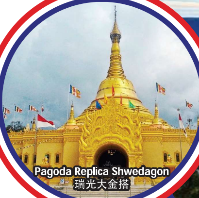
Pagoda Replica Shwedagon 瑞光大金塔

行程次序，以当地旅社安排为准。 Sequences of Itinerary are subject to local arrangement.