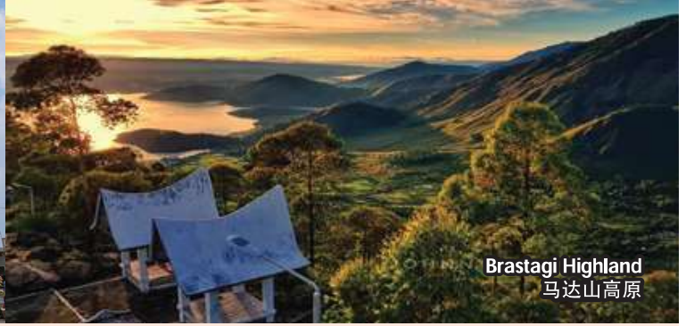
Brastagi Highland 马达山高原