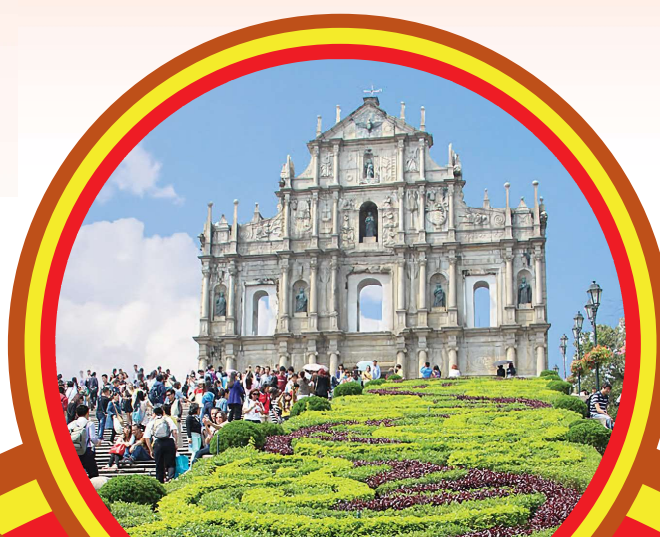
Ruins of St. Paul's