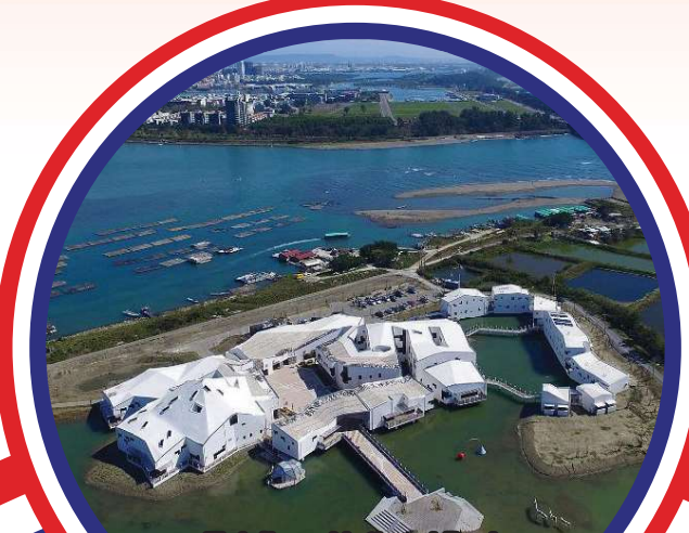
Tai Jiang National Park Visitor Center (White House) 台江国家公园游客服务中心 (白色高脚屋)