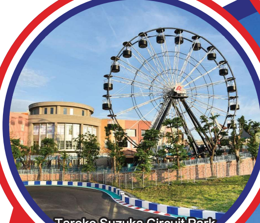
Taroko Suzuka Circuit Park 铃鹿赛道乐园