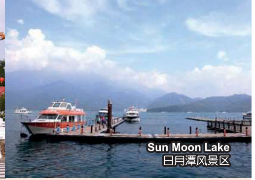
Sun Moon Lake 日月潭风景区