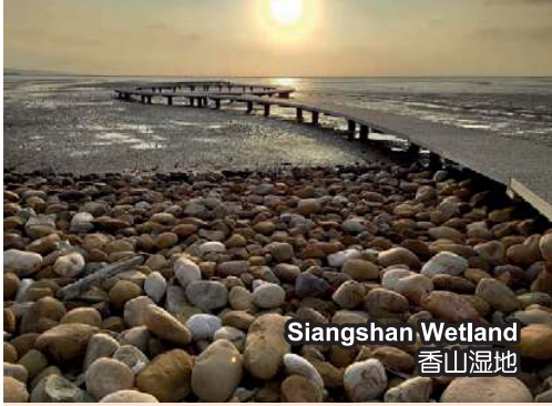
Siangshan Wetland 香山湿地