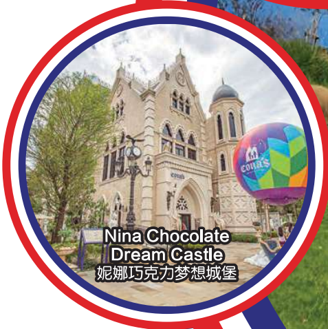
Nina Chocolate Dream Castle 妮娜巧克力梦想城堡