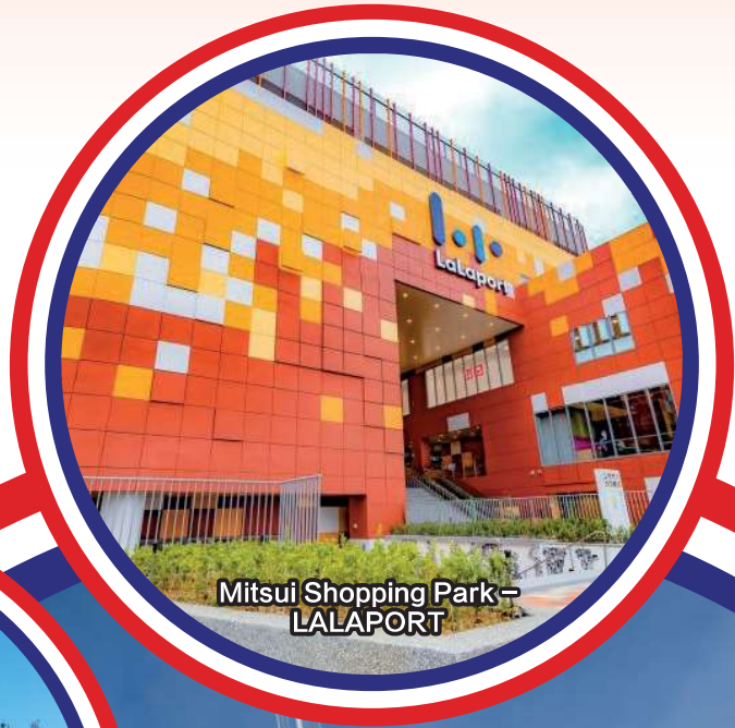
Mitsui Shopping Park - LALAPORT