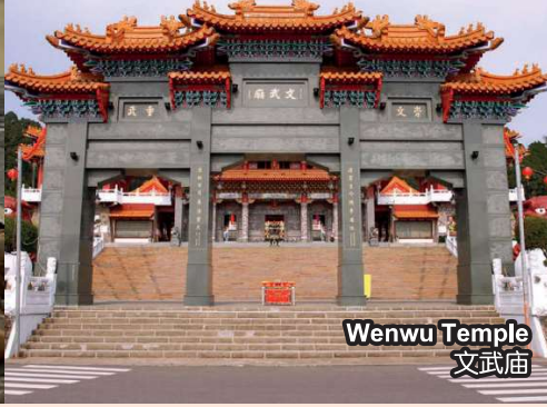
Wenwu Temple 文武庙