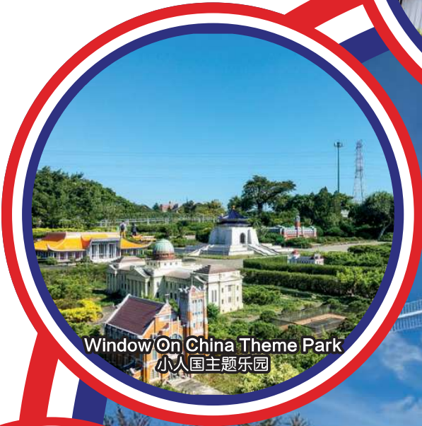
Window On China Theme Park 小人国主题乐园