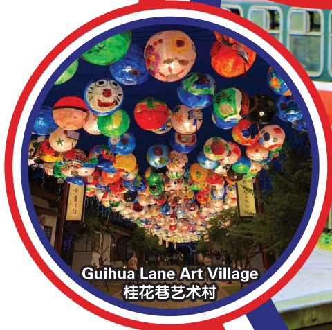
Guihua Lane Art Village 桂花巷艺术村