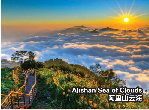
Alishan Sea of Clouds 阿里山云海