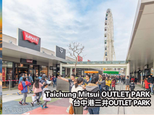
Taichung Mitsui OUTLET PARK 台中港三井OUTLET PARK