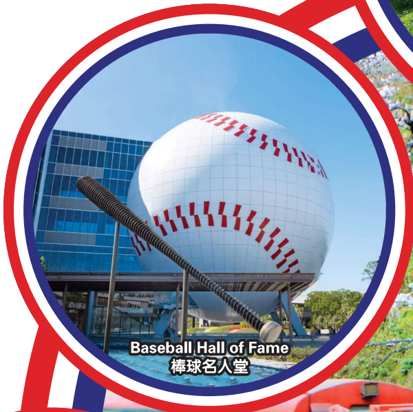
Baseball Hall of Fame 棒球名人堂