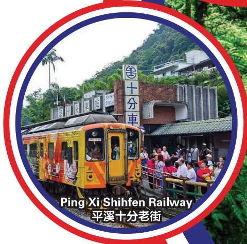
Ping Xi Shihfen Railway 平溪十分老街