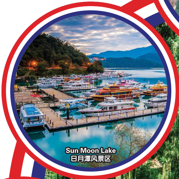
Sun Moon Lake 日月潭风景区