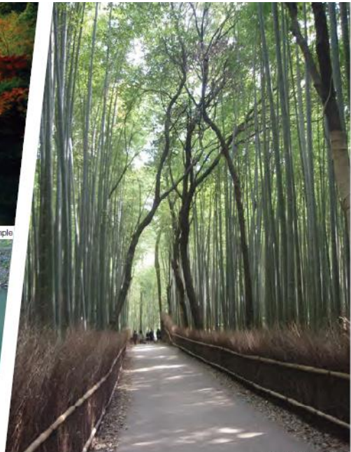
Sagano Bamboo Grove