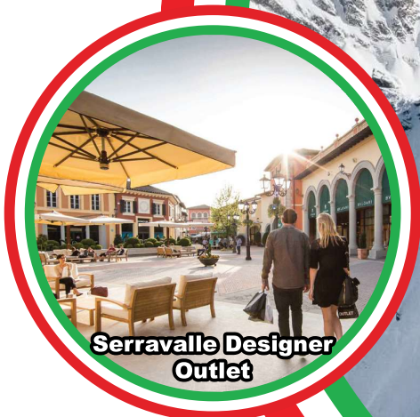
Serravalle Designer Outlet