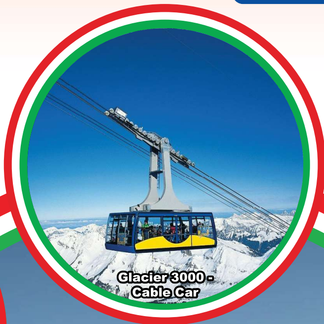
Glacier 3000 - Cable Car