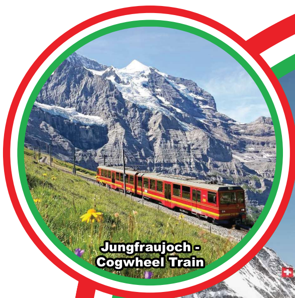
Jungfraujoeh - Cogwheel Train