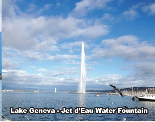
Lake Geneva - Jet d'Eau Water Fountain