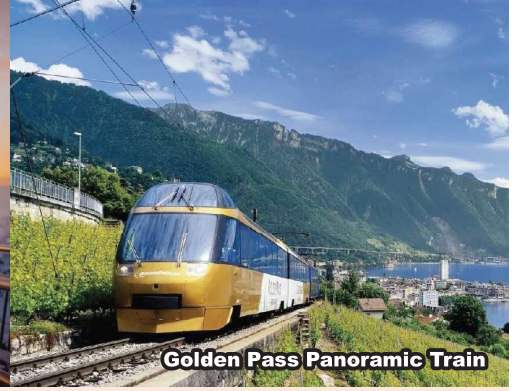
Golden Pass Panoramic Train