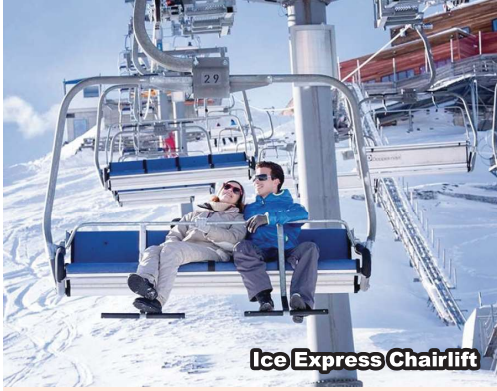
Ice Express Chairlift