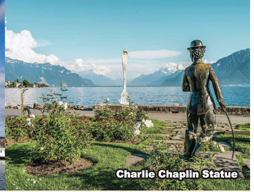
Charlie Chaplin Statue