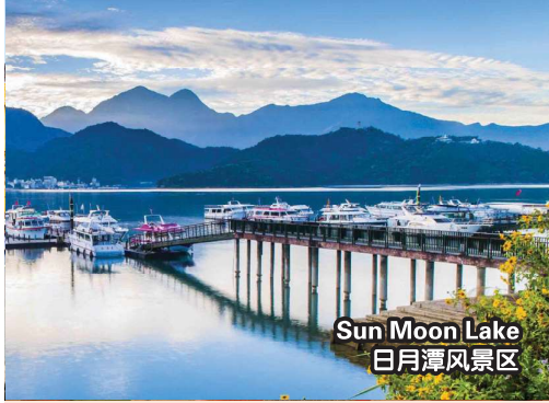
Sun Moon Lake 日月潭风景区