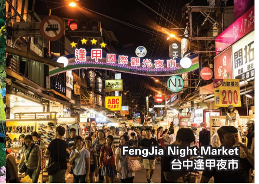
FengJia Night Market 台中逢甲夜市