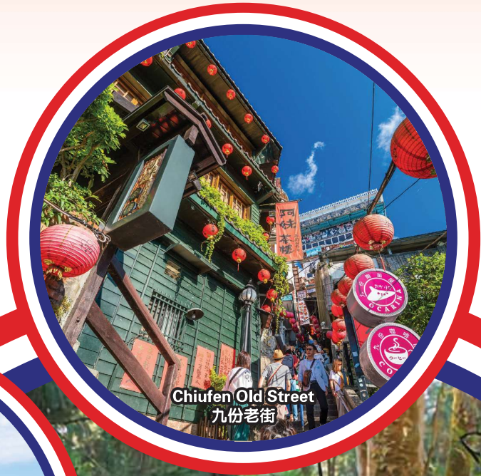
Chiufen Old Street 九份老街