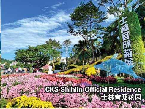
CKS Shihlin Official Residence 士林官邸花园