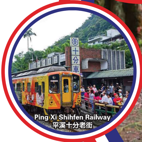
Ping Xi Shihfen Railway 平溪十分老街