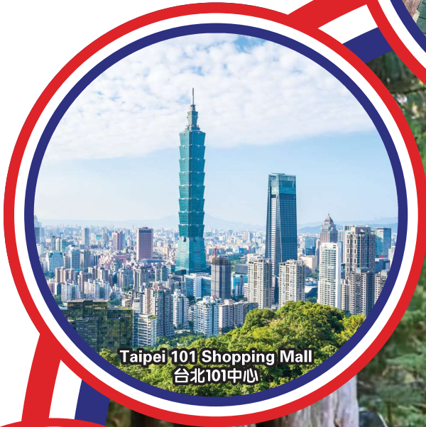
Taipei 101 Shopping Mall 台北101中心