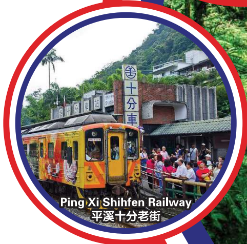
Ping Xi Shihfen Railway 平溪十分老街