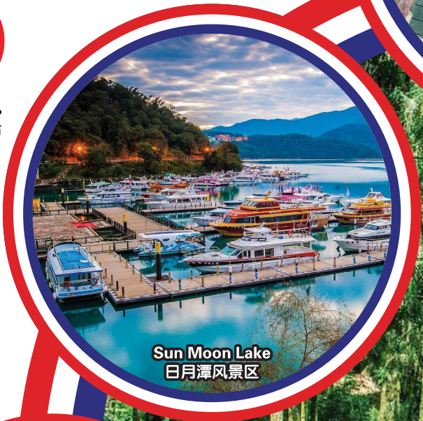
Sun Moon Lake 日月潭风景区