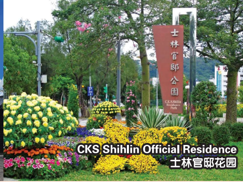
CKS Shihlin Official Residence 士林官邸花園