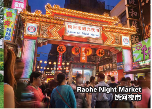
Raohe Night Market 饒河夜市