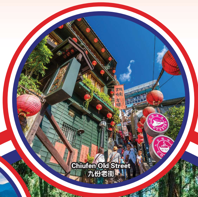
Chiufen Old Street 九份老街