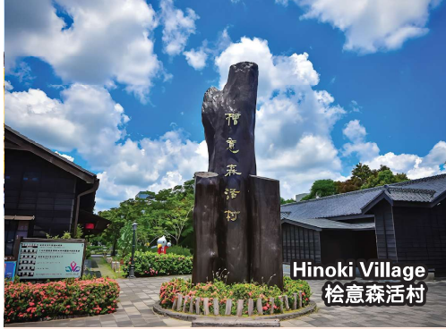
Hinoki Village 桧意森活村