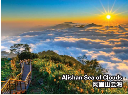
Alishan Sea of Clouds 阿里山云海