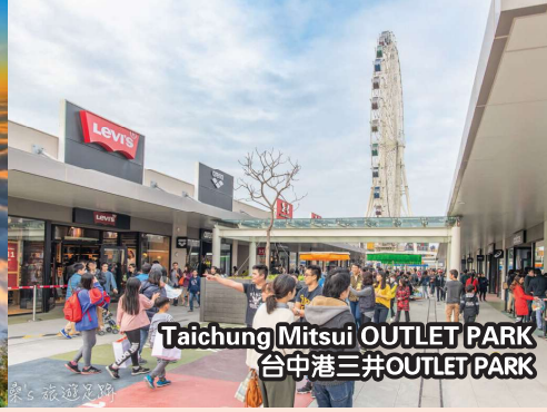
Taichung Mitsui OUTLET PARK 台中港三井OUTLET PARK