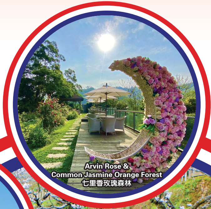
Arvin Rose & Common Jasmine Orange Forest 七里香玫瑰森林