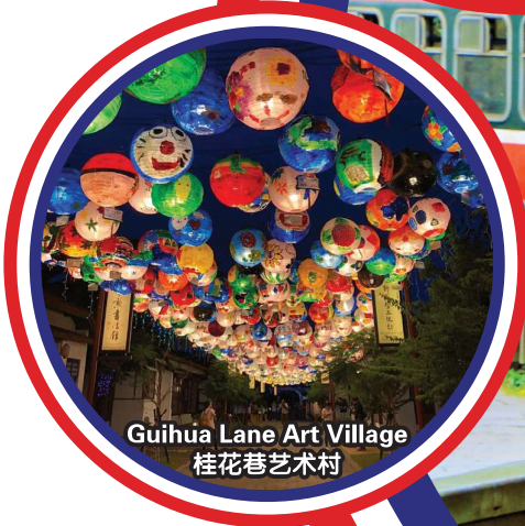
Guihua Lane Art Village 桂花巷艺术村