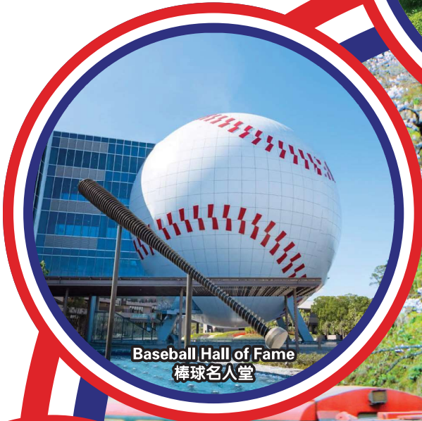
Baseball Hall of Fame 棒球名人堂