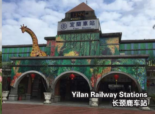
Yilan Railway Stations 长颈鹿车站