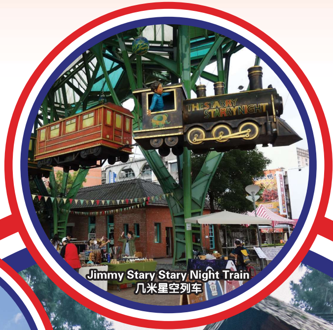
Jimmy Stary Stary Night Train 几米星空列车