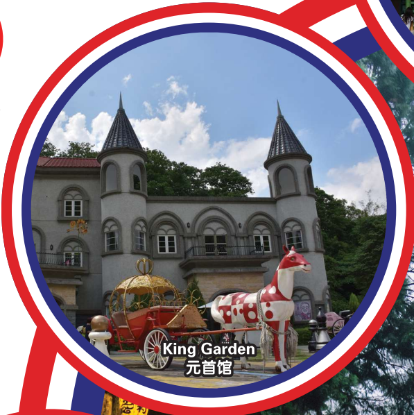
King Garden 元首馆