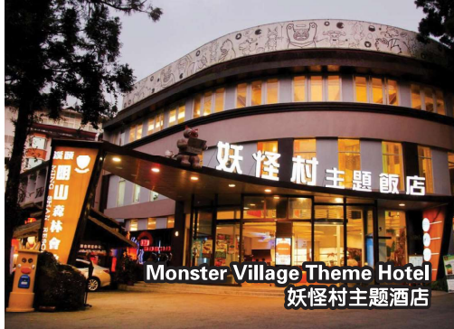
Monster Village Theme Hotel 妖怪村主题酒店