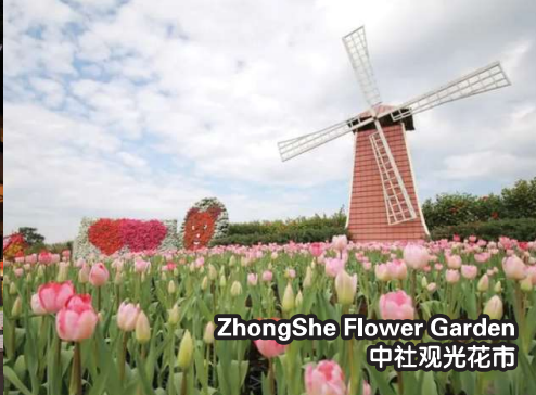
ZhongShe Flower Garden 中社观光花市