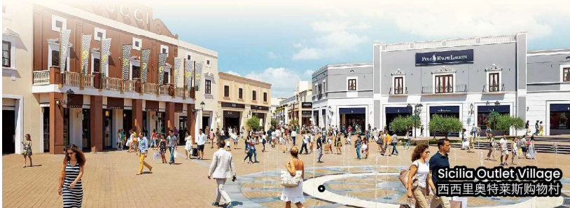
Sicilia Outlet Village 西西里奥特莱斯购物村