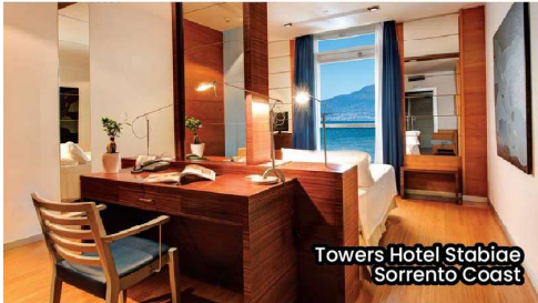
Towers Hotel Stabiae Sorrento Coast