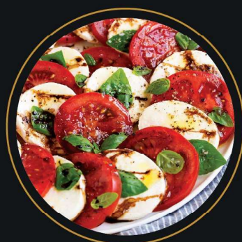
Caprese Salad 番茄芝士沙拉

Experience carefully curated local specialty dishes, savor them firsthand, and immerse yourself in the traditional culture embedded in the ingredients, conveyed through the excitement of your taste buds. Be touched by the chef's skill in preserving the authentic flavors, showcasing a profound love for their homeland.