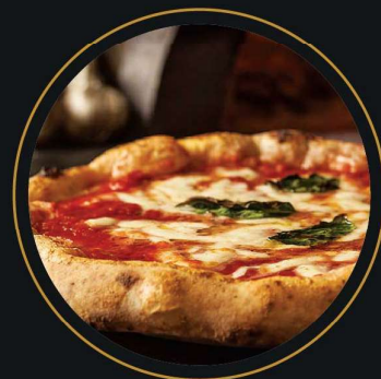
Pizza Napoletana 拿坡里塔纳比萨