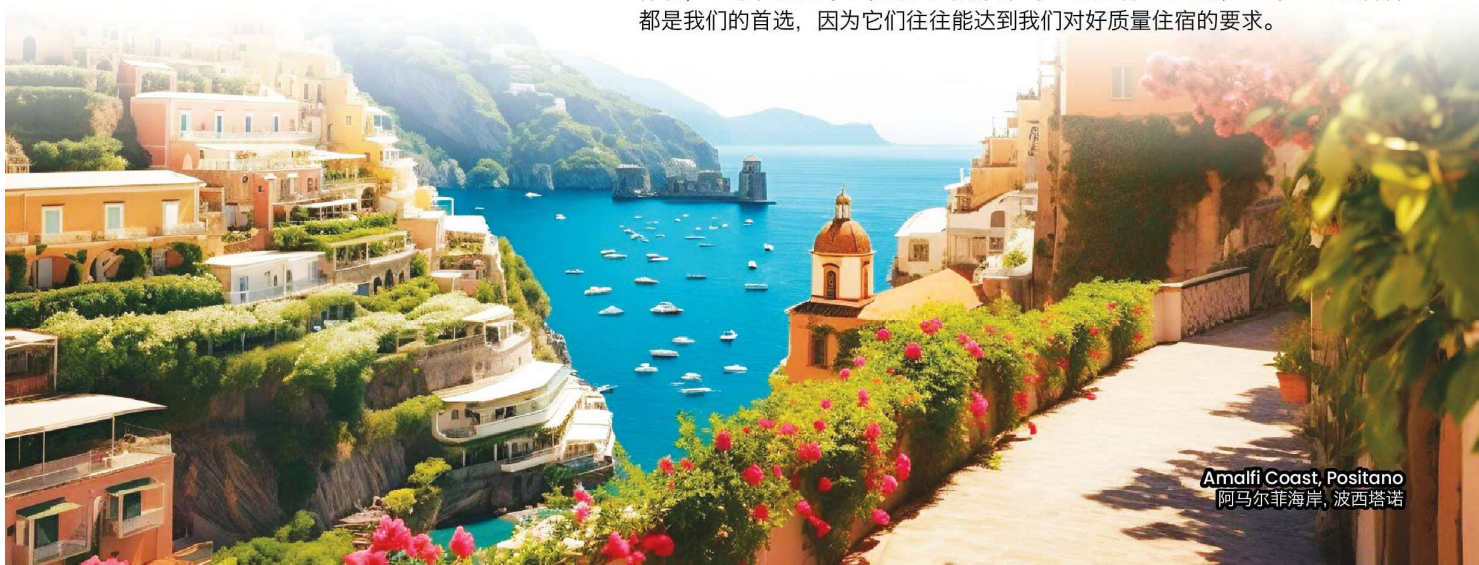
Amalfi Coast, Positano 阿马尔菲海岸，波西塔诺

我们一直秉承着宾至如归的理念来挑选酒店。我们经常以酒店的房型、地理位置，甚至房内可欣赏到的景色来尽心筛选，以确保为您提供最符合标准的住宿体验，让您在旅途中也能感受到如同在家一般的舒适。通常4星和5星级酒店都是我们的首选，因为它们往往能达到我们对好质量住宿的要求。