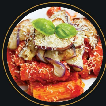
Pasta alla Norma 诺玛意大利面