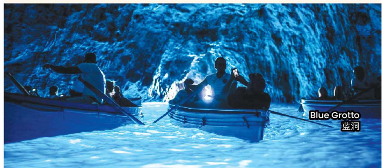
Blue Grotto 蓝洞