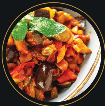
Sicilian Caponata 西西里燉菜