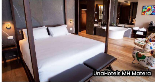
UnaHotels MH Matera