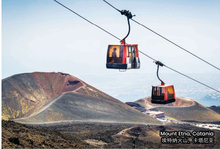
Mount Etna, Catania 埃特纳火山, 卡塔尼亚