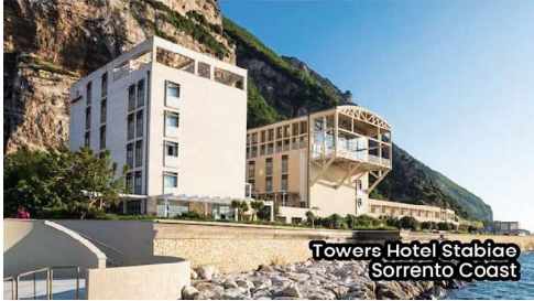
Towers Hotel Stabiae Sorrento Coast

Embark on a complete journey at 4-star & 5-star hotel, offering a quality & comfortable stay. 全程安排四+五星级酒店，让您在整个旅程中享受到有质量且舒适的住宿环境。