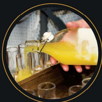
Limoncello di Sicilia 西西里岛柠檬酒