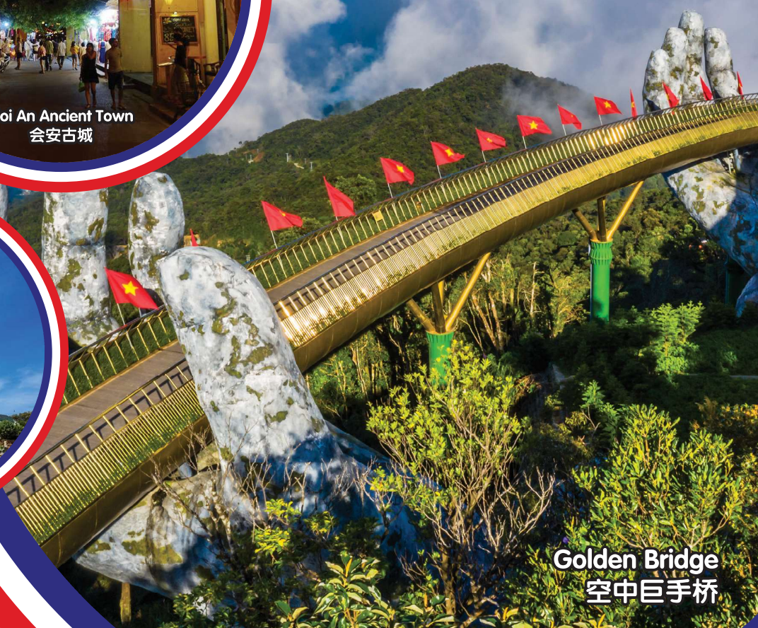
Golden Bridge 空中巨手桥