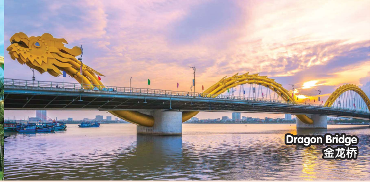
Dragon Bridge 金龙桥