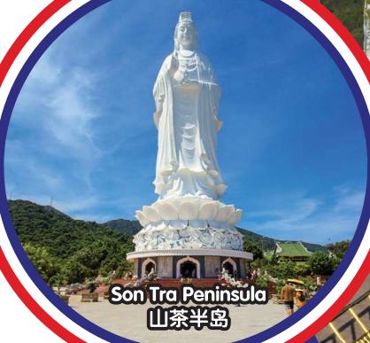
Son Tra Peninsula 山茶半岛