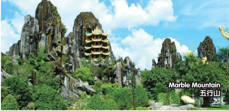
Marble Mountain 五行山