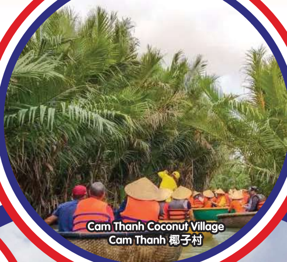
Cam Thanh Coconut Village Cam Thanh 椰子村