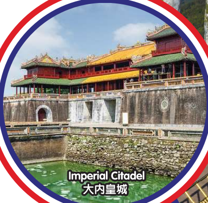
Imperial Citadel 大内皇城