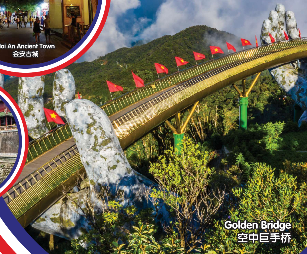
Golden Bridge 空中巨手桥