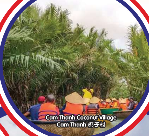
Cam Thanh Coconut Village Cam Thanh 椰子村