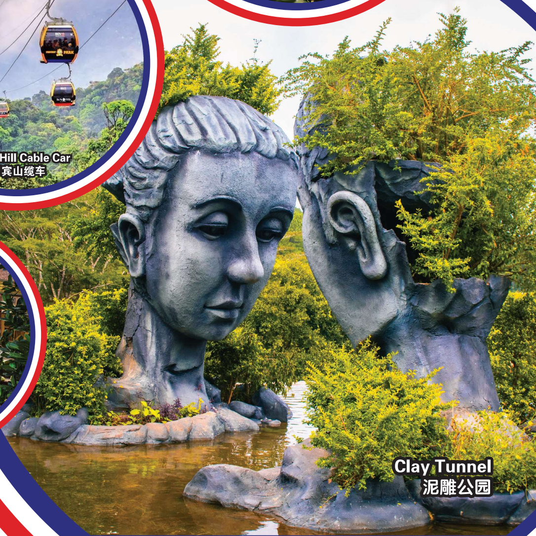
Clay Tunnel 泥雕公园