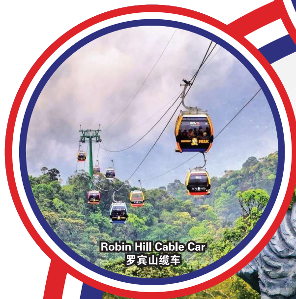
Robin Hill Cable Car 罗宾山缆车