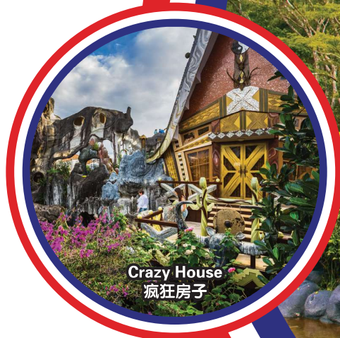
Crazy House 疯狂房子