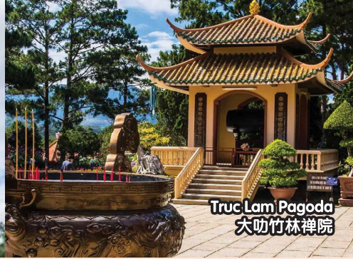
Truc Lam Pagoda 大叻竹林禅院