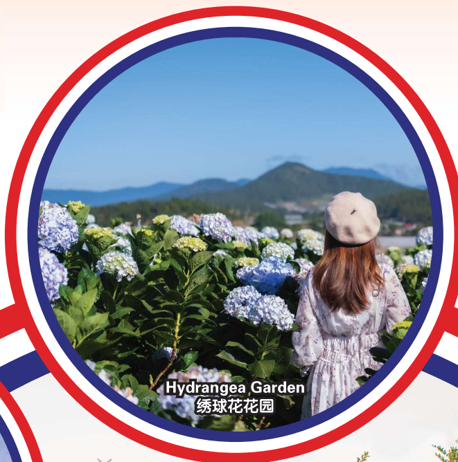
Hydrangea Garden 绣球花花园