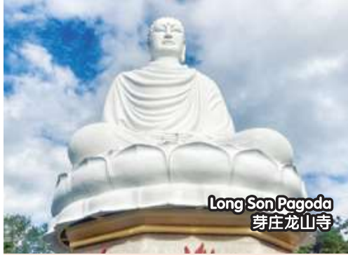
Long Son Pagoda 芽庄龙山寺