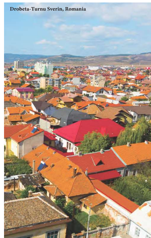
Drobeta-Turnu Severin, Romania

Drive towards the Golubac Fortress, located on a hill slope overlooking the Danube River, to visit this fortified ten-tower town. Afterward, embark on a cruise through the gorge, witnessing the most beautiful sections of the Danube. Cross the border into Romania and head to Drobeta-Turnu Severin for dinner and an overnight stay. (B, D)