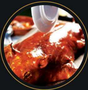
Segovia Suckling Pig 塞哥维亚烤乳猪