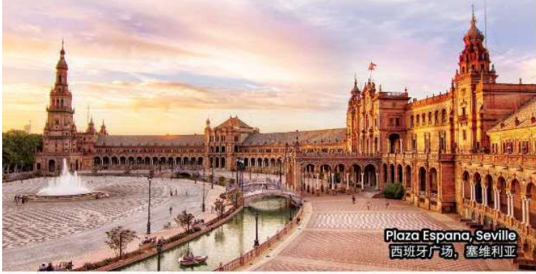
Plaza España, Seville 西班牙广场, 塞维利亚