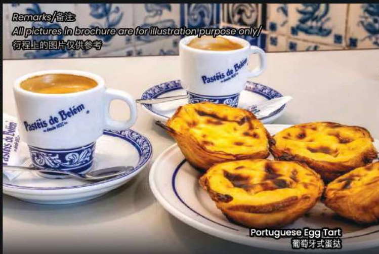
Portuguese Egg Tart 葡萄牙式蛋挞

All pictures in brochure are for illustration purpose only/ 行程上的图片仅供参考