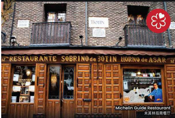
Michelin Guide Restaurant 米其林指南餐厅

Established in 1725, this Michelin Guide restaurant has been operating for more than 300 years and has been recognised by the Guinness Book of Records as the "oldest restaurant". 成立于1725年的米其林指南的餐厅至今已经连续运营了三百多年, 被吉尼斯纪录誉为“最古老的餐厅”。