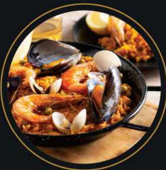
Seafood Paella 西班牙海鲜炖饭