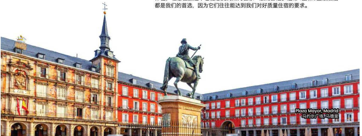
Plaza Mayor, Madrid 马约尔广场, 马德里

我们一直秉承着宾至如归的理念来挑选酒店。我们经常以酒店的房型、地理位置，甚至房内可欣赏到的景色来尽心筛选，以确保为您提供最符合标准的住宿体验，让您在旅途中也能感受到如同在家一般的舒适。通常4星和5星级酒店都是我们的首选，因为它们往往能达到我们对好质量住宿的要求。