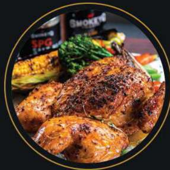
Peri-peri chicken 葡式烤鸡