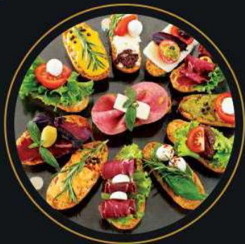
Premium Tapas 西班牙精致传统小吃