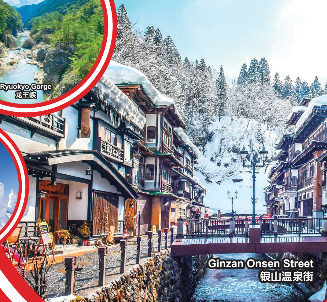
Ginzan Onsen Street 银山温泉街

行程次序，以当地旅社安排为准。 Sequences of Itinerary are subject to local arrangement.