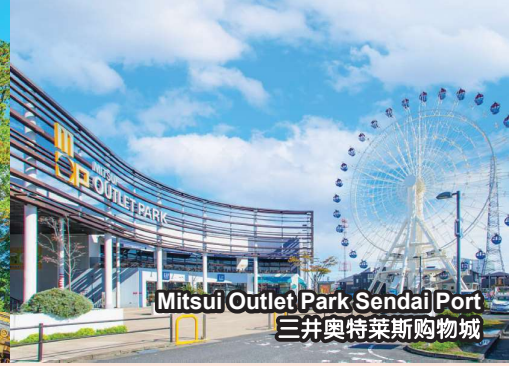
Mitsui Outlet Park Sendai Port 三井奥特莱斯购物城