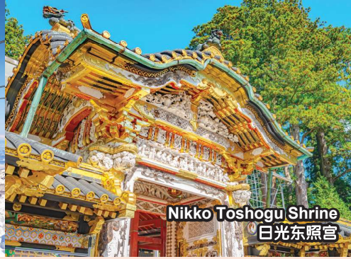
Nikko Toshogu Shrine 日光东照宫