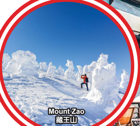
Mount Zao 藏王山