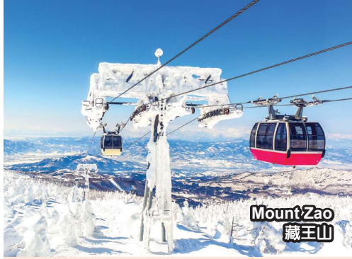
Mount Zao 藏王山