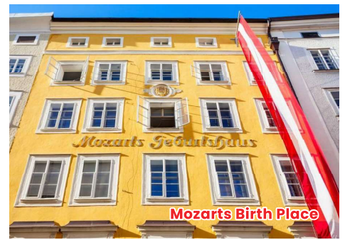
Mozart's Birth Place