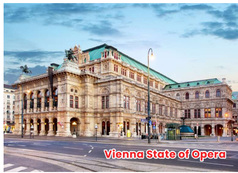
Vienna State of Opera