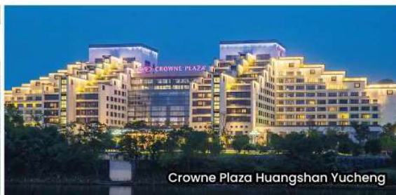
Crowne Plaza Huangshan Yucheng