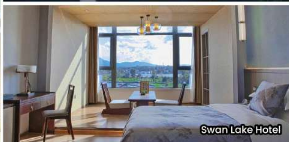
Swan Lake Hotel