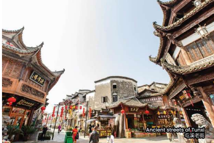
Ancient streets of Tunxi 屯溪老街