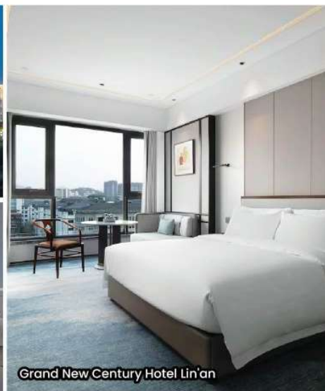
Grand New Century Hotel Lin'an