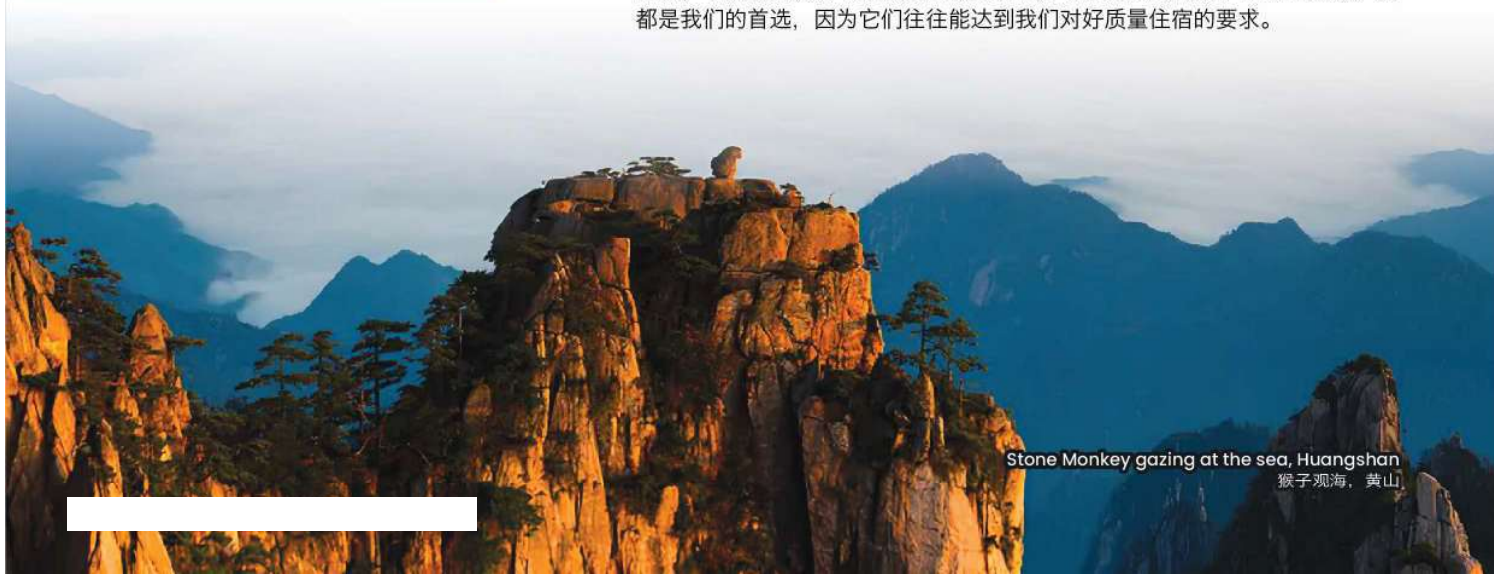
Stone Monkey gazing at the sea, Huangshan 猴子观海，黄山

我们一直秉承着宾至如归的理念来挑选酒店。我们经常以酒店的房型、地理位置，甚至房内可欣赏到的景色来尽心筛选，以确保为您提供最符合标准的住宿体验，让您在旅途中也能感受到如同在家一般的舒适。通常4星和5星级酒店都是我们的首选，因为它们往往能达到我们对好质量住宿的要求。