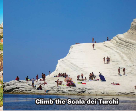
Climb the Scala dei Turchi