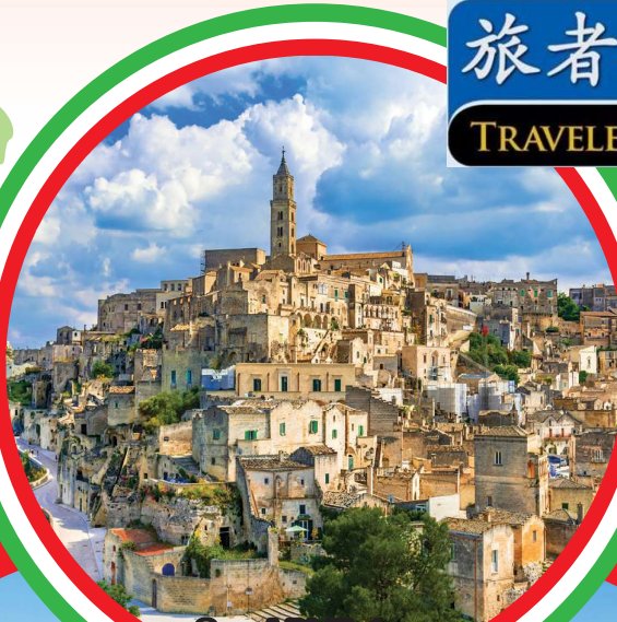
Sassi Di Matera