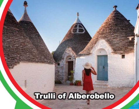
Trulli of Alberobello