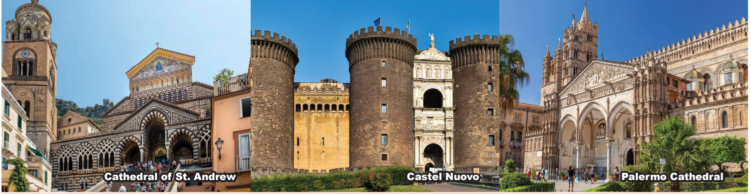
Cathedral of St. Andrew