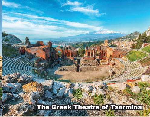
The Greek Theatre of Taormina