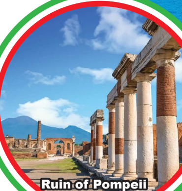
Ruin of Pompeii