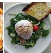
Mozzarella di Bufala