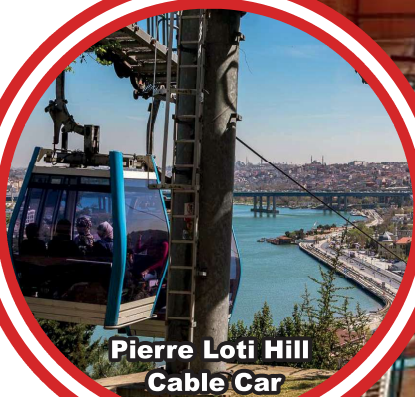
Pierre Loti Hill Cable Car