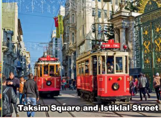
Taksim Square and Istiklal Street