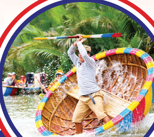
Cam Thanh Coconut Village Cam Thanh 椰子村