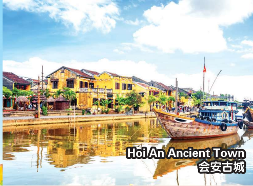
Hoi An Ancient Town 会安古城