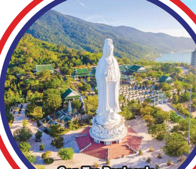
Son Tra Peninsula 山茶半岛