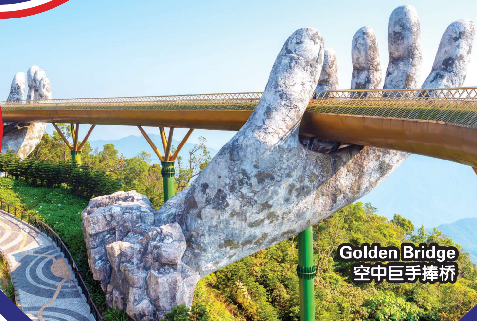
Golden Bridge 空中巨手捧桥