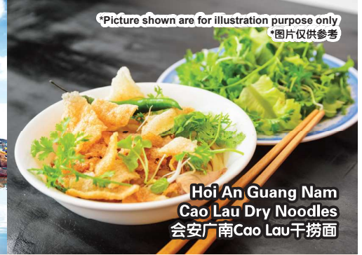
Hoi An Guang Nam Cao Lau Dry Noodles 会安广南Cao Lau干捞面

*Picture shown are for illustration purpose only *图片仅供参考