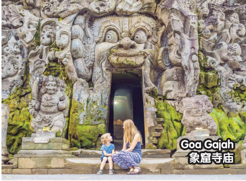
Goa Gajah 象窟寺庙