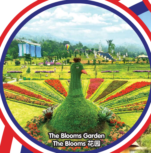
The Blooms Garden The Blooms 花园