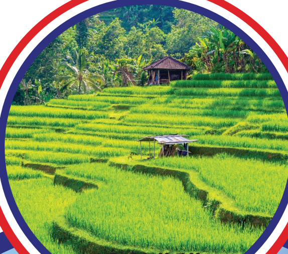
Jatiluwih Paddy Field 加德路易水稻梯田