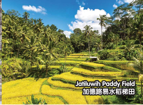
Jatiluwih Paddy Field 加德路易水稻梯田