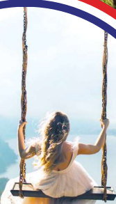
Desa Swing Desa秋千