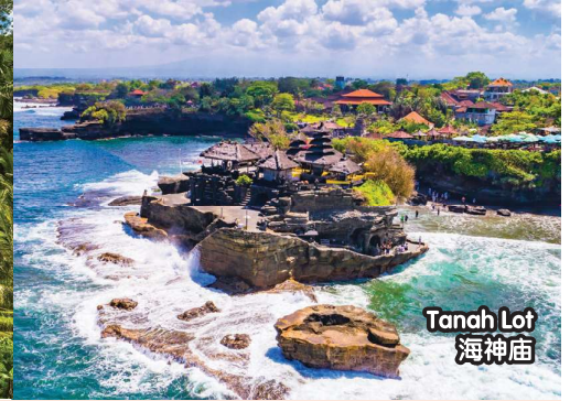
Tanah Lot 海神庙