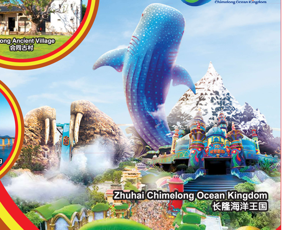
Zhuhai Chimelong Ocean Kingdom 长隆海洋王国