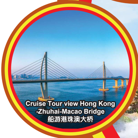
Cruise Tour view Hong Kong -Zhuhai-Macao Bridge 船游港珠澳大桥