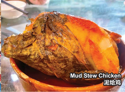
Mud Stew Chicken 泥焗鸡