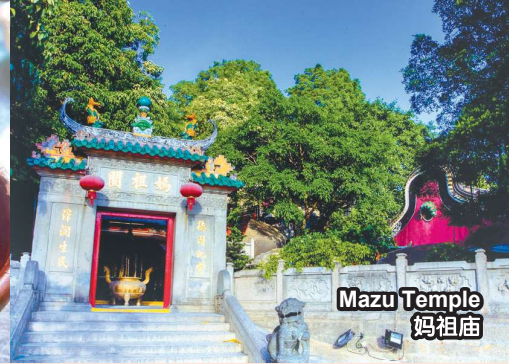
Mazu Temple 妈祖庙