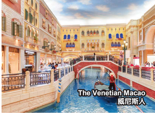
The Venetian Macao 威尼斯人