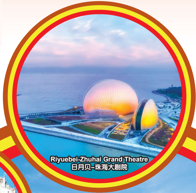
Riyuebei-Zhuhai Grand Theatre 日月贝-珠海大剧院