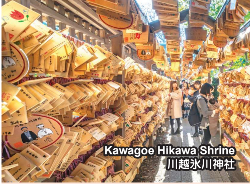
Kawagoe Hikawa Shrine 川越氷川神社