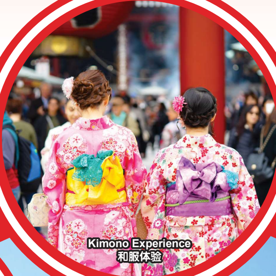
Kimono Experience 和服体验