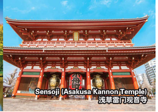
Sensoji (Asakusa Kannon Temple) 浅草雷門観音寺