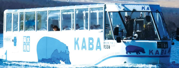
Yamanakaku KABA Bus 山中湖的河马 (水陆两用巴士)

行程次序，以当地旅社安排为准。 Sequences of Itinerary are subject to local arrangement.