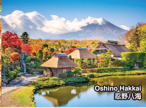
Oshino Hakkai 忍野八海