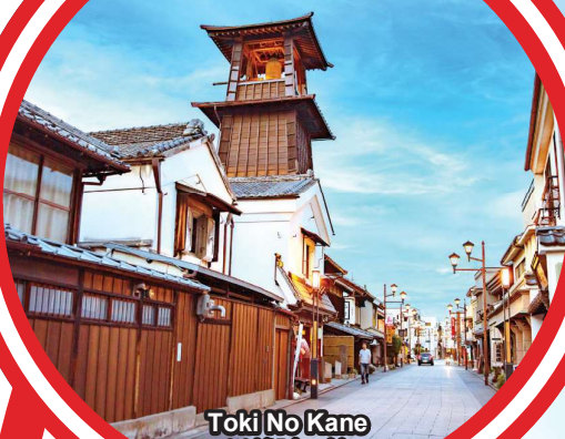
Toki No Kane 川越時の钟