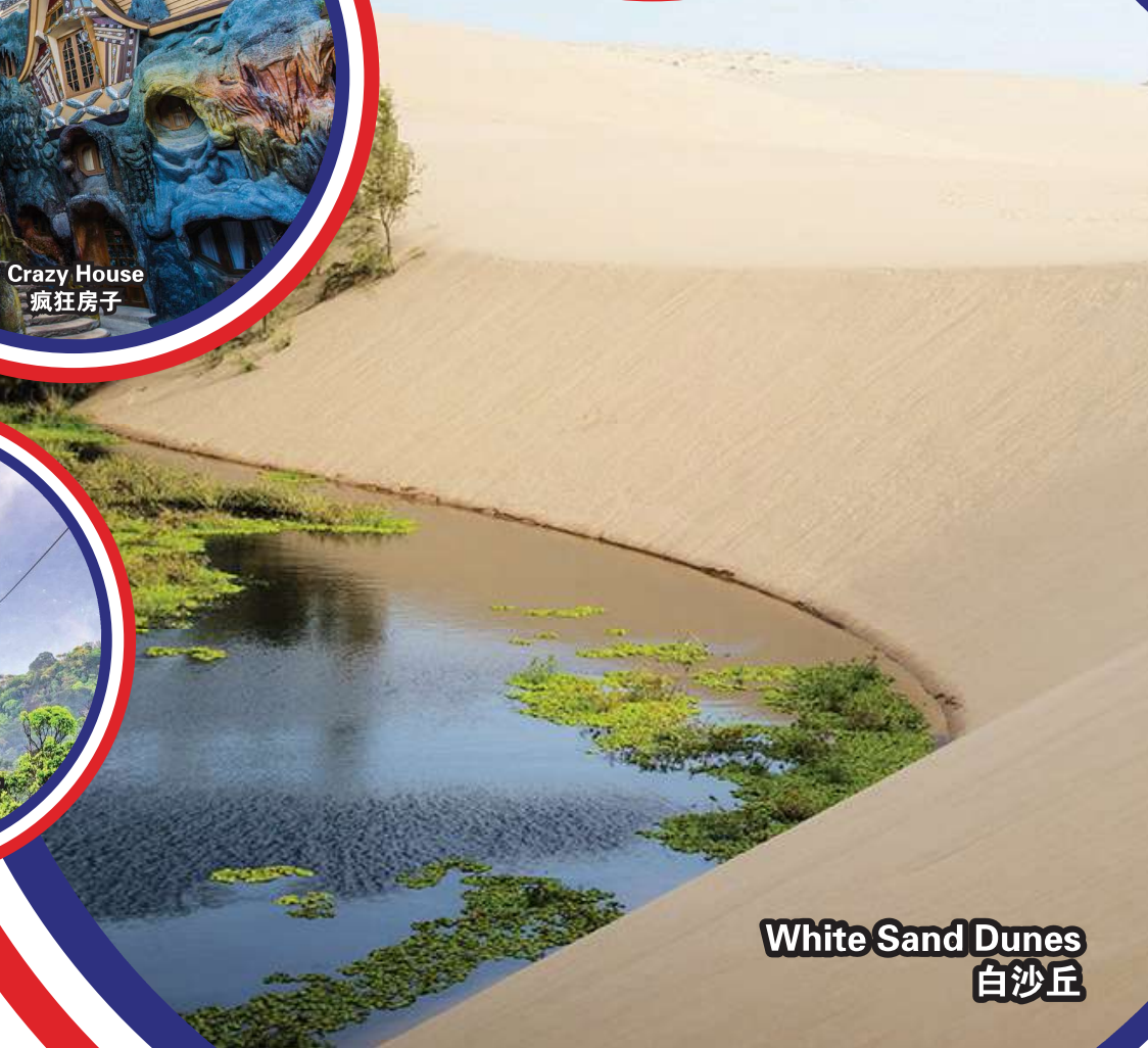
White Sand Dunes 白沙丘