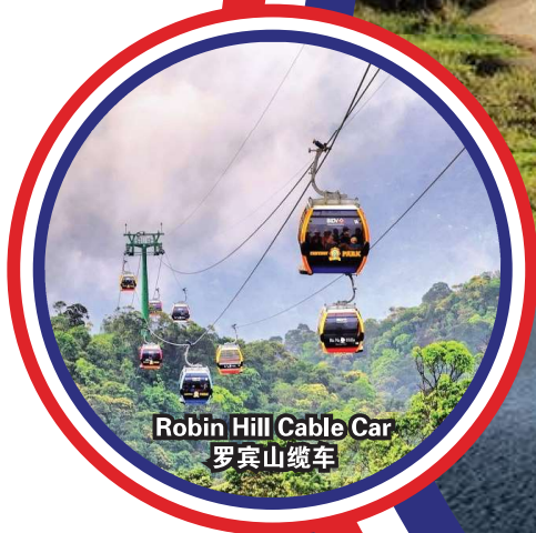
Robin Hill Cable Car 罗宾山缆车