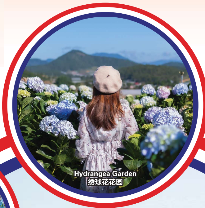
Hydrangea Garden 绣球花花园