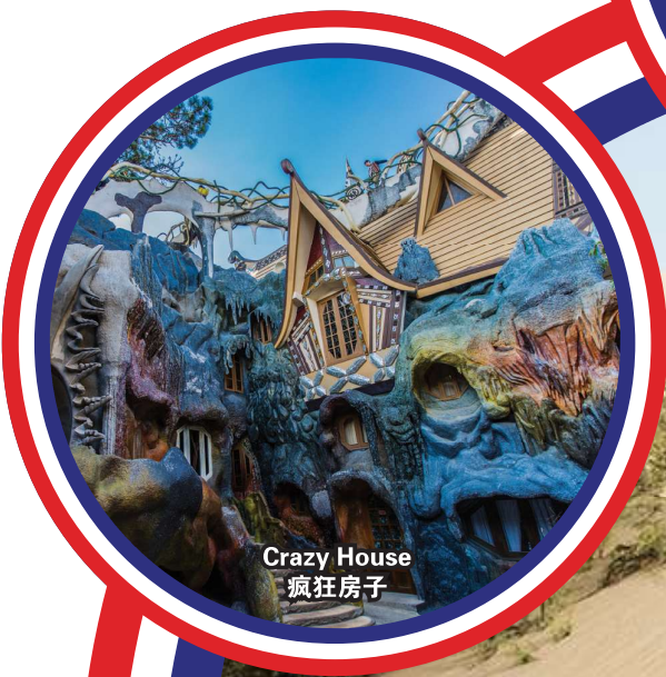
Crazy House 疯狂房子