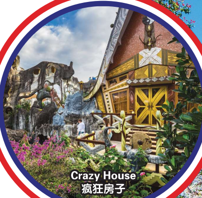
Crazy House 疯狂房子