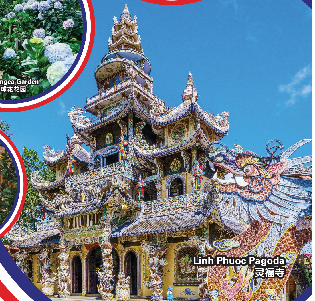
Linh Phuoc Pagoda 灵福寺

行程次序，以當地旅社安排為準。 Sequences of Itinerary are subject to local arrangement.