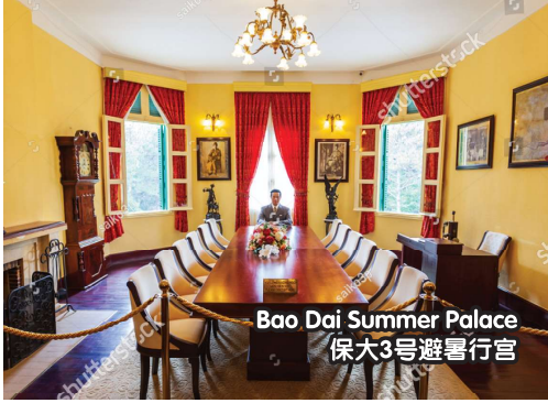
Bao Dai Summer Palace 保大3号避暑行宫