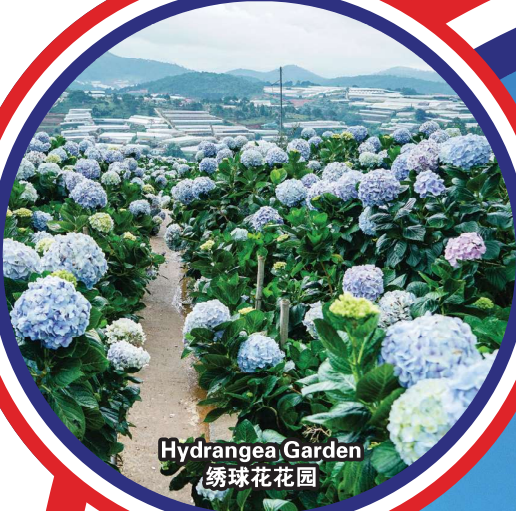
Hydrangea Garden 绣球花花园