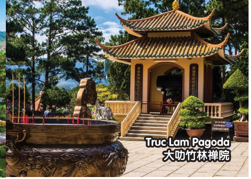
Truc Lam Pagoda 大叻竹林禅院