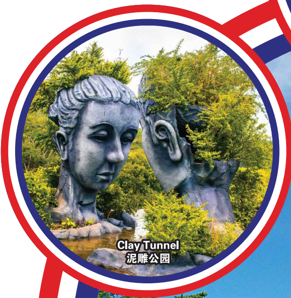
Clay Tunnel 泥雕公园