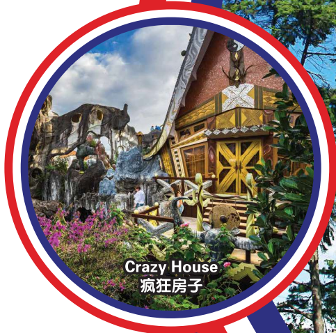
Crazy House 疯狂房子