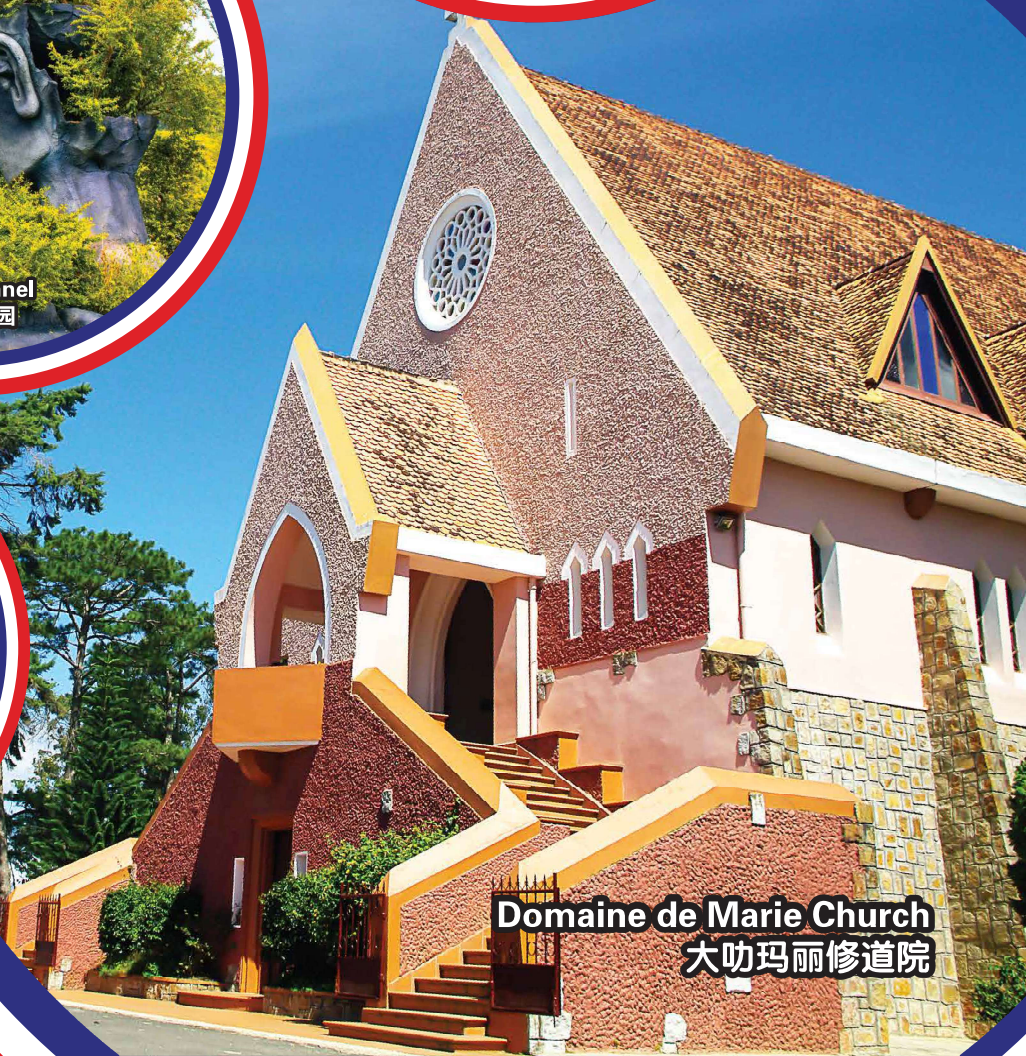
Domaine de Marie Church 大叻玛丽修道院