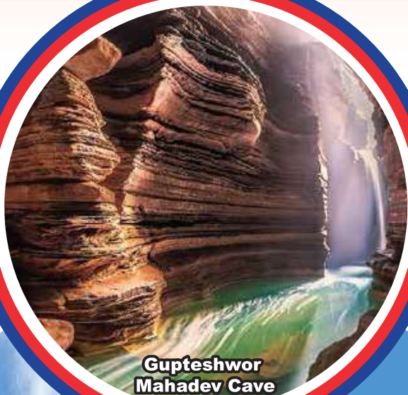
Gupteshwor Mahadev Cave