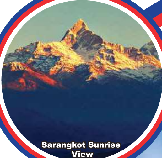
Sarangkot Sunrise View