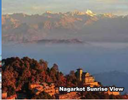
Nagarkot Sunrise View