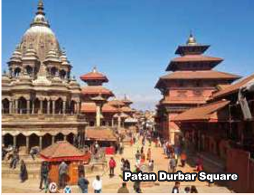
Patan Durbar Square