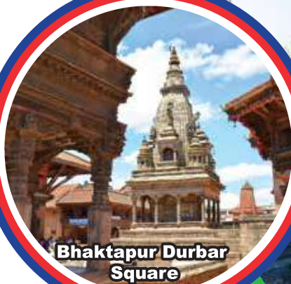
Bhaktapur Durbar Square