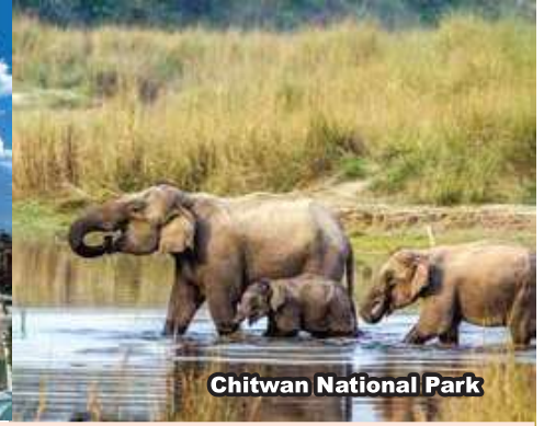
Chitwan National Park