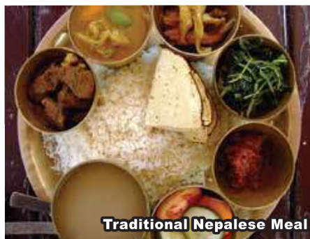
Traditional Nepalese Meal

Disclaimer: Due to Covid-19 travel restrictions, local / religious festivals, public holidays, weather condition, transport technical issue, acts of nature, Golden Destinations reserved the right to alter the sequence or change, amend or alter the itinerary if necessary, with or without prior notice.