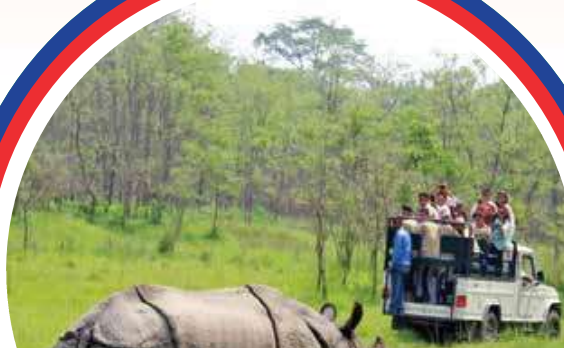
Chitwan National Park - 4x4 Jeep Safari Wheel Drive