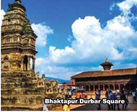
Bhaktapur Durbar Square