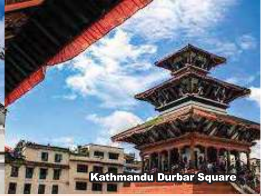
Kathmandu Durbar Square