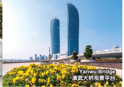
Yanwu Bridge 滨武大桥观景平台