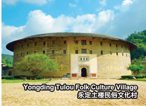
Yongding Tulou Folk Culture Village 永定土楼民俗文化村