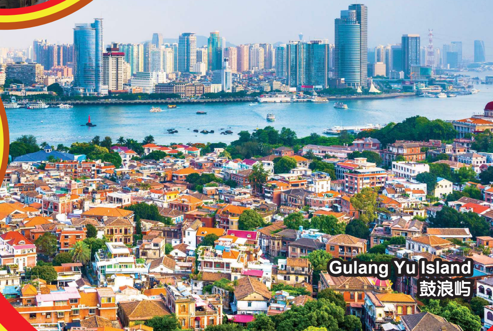
Gulang Yu Island 鼓浪屿

行程次序, 以当地旅社安排为准。 Sequences of Itinerary are subject to local arrangement.