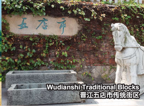
Wudianshi Traditional Blocks 晋江五店市传统街区