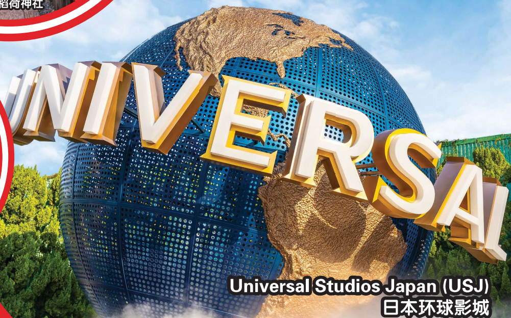
Universal Studios Japan (USJ) 日本环球影城