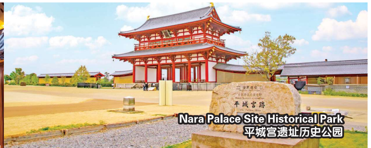
Nara Palace Site Historical Park 平城宫遗址历史公园

Disclaimer: Due to Covid-19 travel restrictions, local / religious festivals, public holidays, weather condition, transport technical issue, acts of nature, Golden Destinations reserved the right to alter the sequence or change, amend or alter the itinerary if necessary, with or without prior notice.