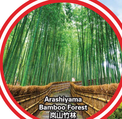
Arashiyama Bamboo Forest 岚山竹林