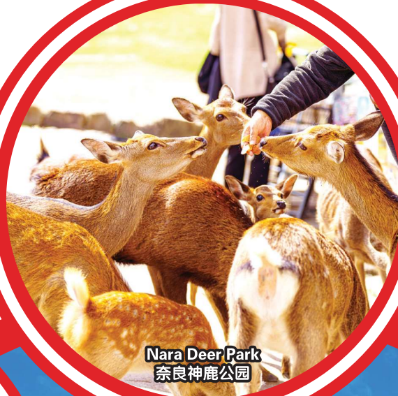
Nara Deer Park 奈良神鹿公园