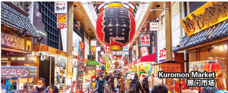
Kuromon Market 黑门市场