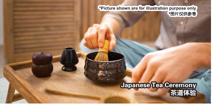
Japanese Tea Ceremony 茶道体验

*Picture shown are for illustration purpose only *图片仅供参考