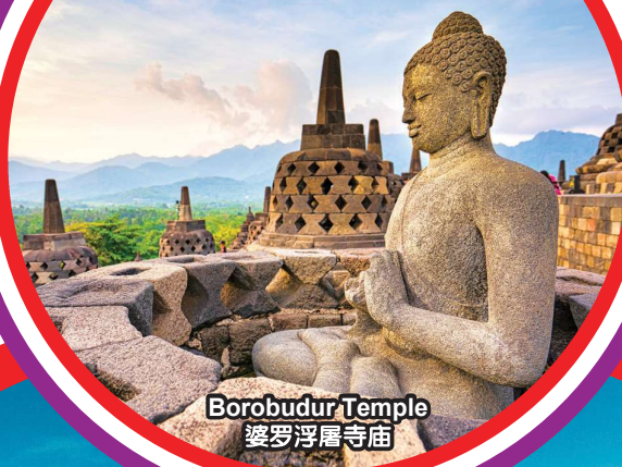
Borobudur Temple 婆罗浮屠寺庙