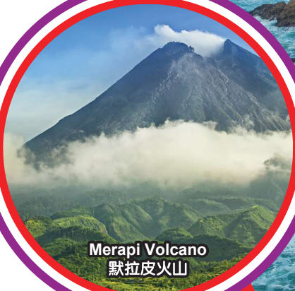
Merapi Volcano 默拉皮火山

行程次序，以当地旅社安排为准。 Sequences of Itinerary are subject to local arrangement.