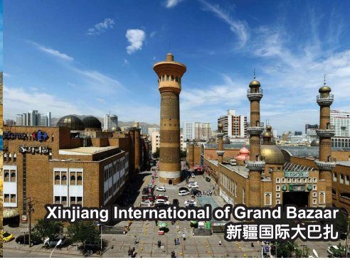
Xinjiang International of Grand Bazaar 新疆国际大巴扎