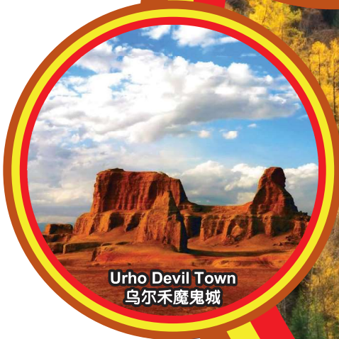
Urho Devil Town 乌尔禾魔鬼城