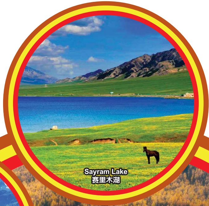
Sayram Lake 赛里木湖