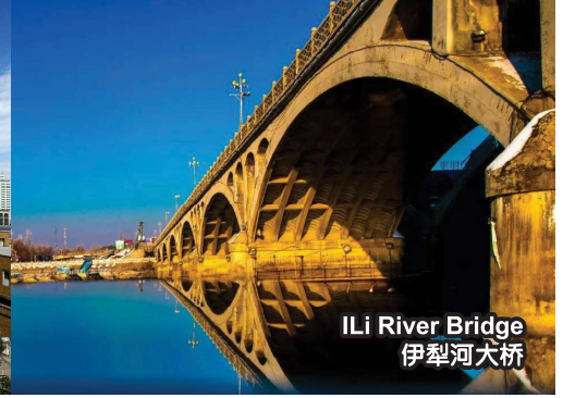
Ili River Bridge 伊犁河大桥