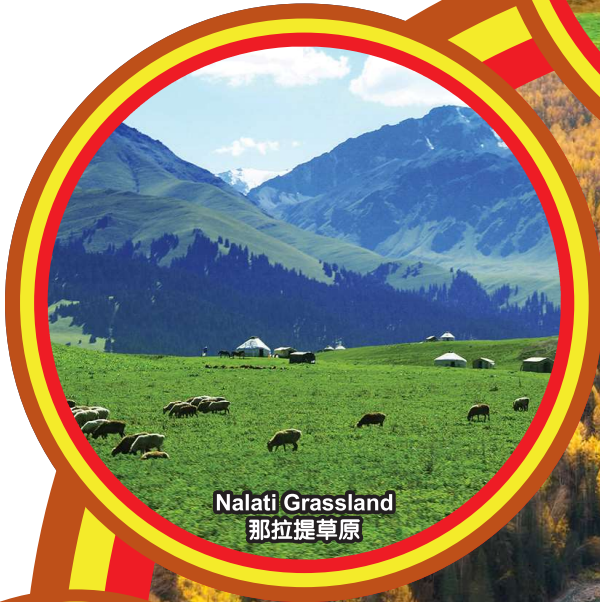
Nalati Grassland 那拉提草原