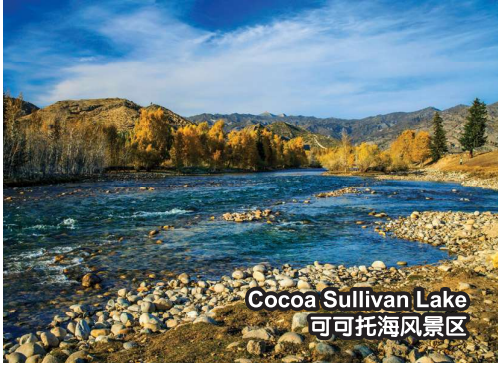
Cocoa Sullivan Lake 可可托海风景区