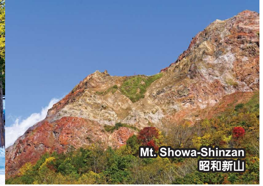
Mt. Showa-Shinzan 昭和新山