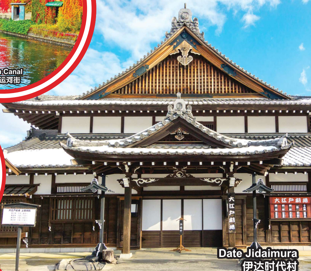
Date Jidaimura 伊达时代村

行程次序，以當地旅社安排為準。 Sequences of Itinerary are subject to local arrangement.