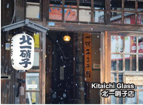
Kitaichi Glass 北一硝子店