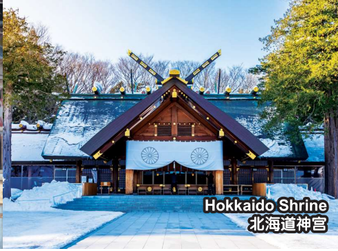
Hokkaido Shrine 北海道神宮