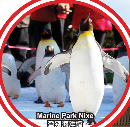
Marine Park Nisei 登别海洋馆