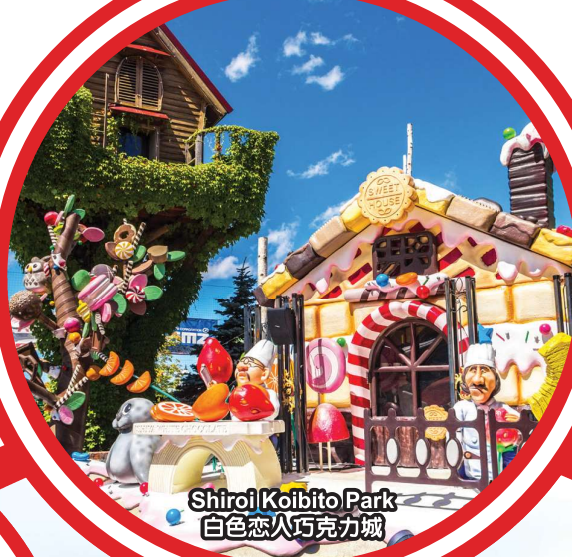
Shiroyoi Kolbitto Park 白色恋人巧克力城