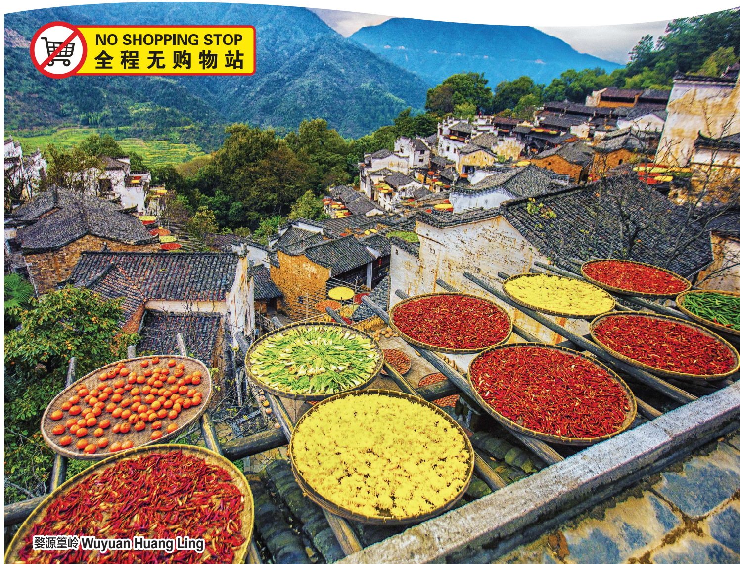
婺源篁岭 Wuyuan Huang Ling