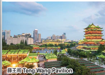
滕王阁 Teng Wang Pavilion