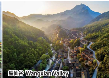
望仙谷 Wangxian Valley