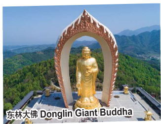
东林大佛 Donglin Giant Buddha