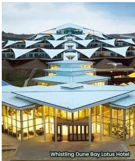
Whistling Dune Bay Lotus Hotel

Embark on a complete journey at 4-star & 5-star hotel, offering a quality & comfortable stay. 全程安排四+五星级酒店，让您在整个旅程中享受到有质量且舒适的住宿环境。