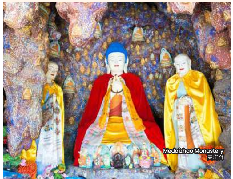
Medaizhao Monastery 美岱召