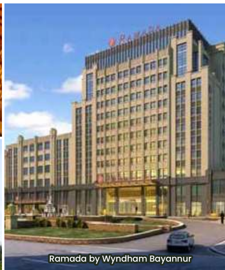
Ramada by Wyndham Bayannur