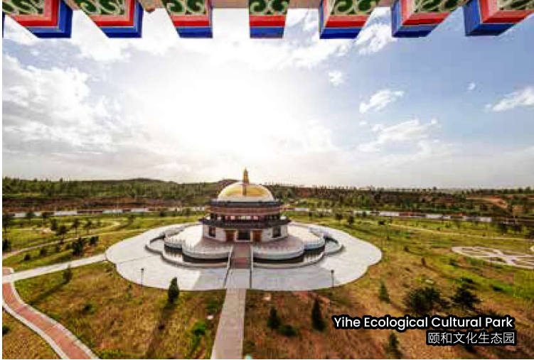
Yihe Ecological Cultural Park 颐和文化生态园