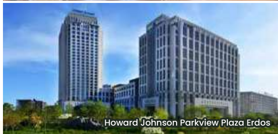
Howard Johnson Parkview Plaza Erdos