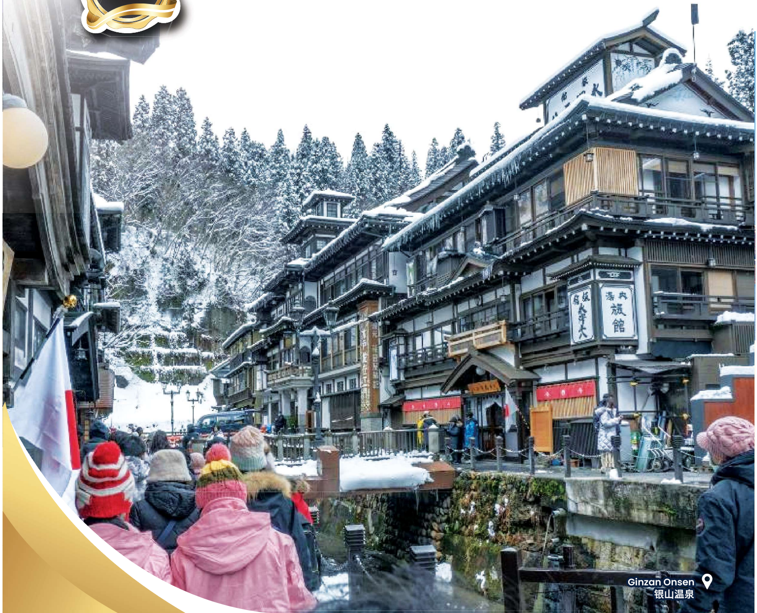
Ginzan Onsen 银山温泉

TOKYO | TOCHIGI | AIZUWAKAMATSU | SENDAI | AOMORI | HAKODATE | TOYAKO | OTARU | SAPPORO