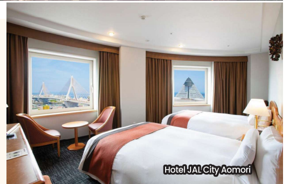
Hotel JAL City Aomori