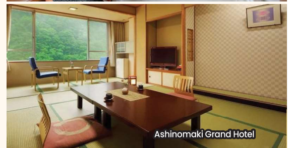
Ashinomaki Grand Hotel