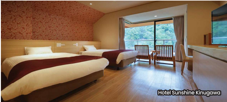
Hotel Sunshine Kinugawa