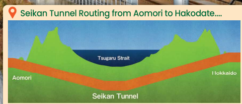
Seikan Tunnel Crossing 青函海底隧道

日本的 新干线，通常被称为子弹火车，以其速度和高效性而闻名。从 青森 到 函馆 乘坐新干线，体验一段顺畅且激动人心的旅程。在这条路线中，E5系列新干线的最高时速可达 320公里/小时（199英里/小时）。