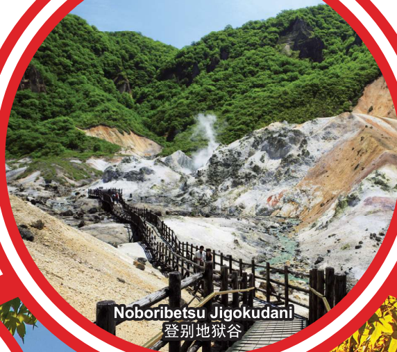
Noboribetsu Jigokudani 登别地狱谷