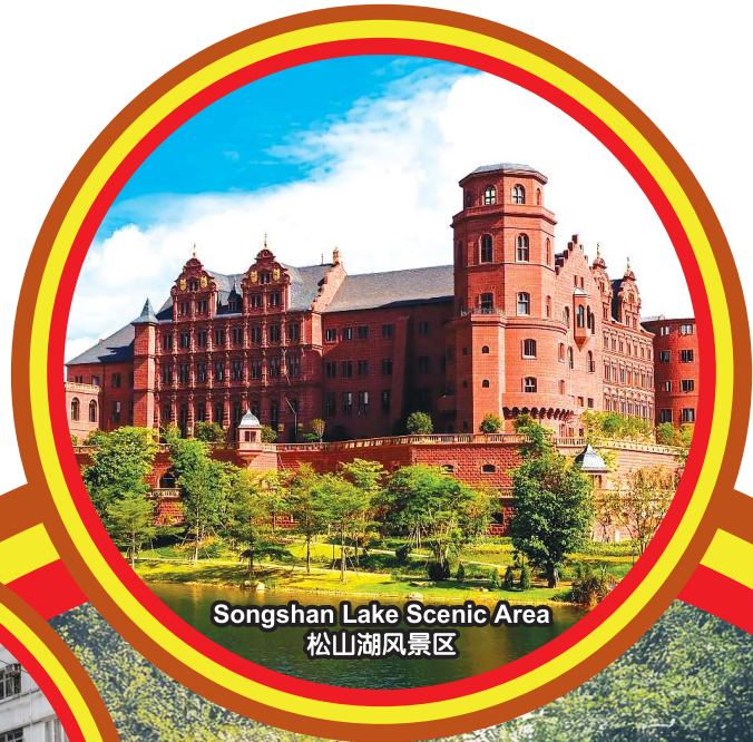
Songshan Lake Scenic Area 松山湖风景区