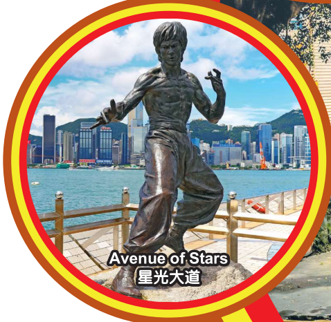
Avenue of Stars 星光大道