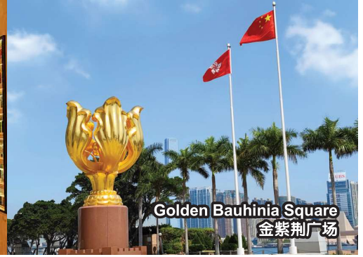
Golden Bauhinia Square 金紫荆广场