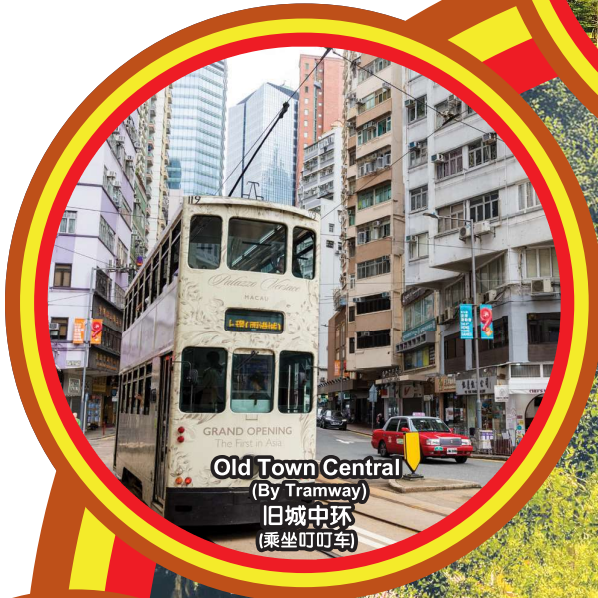
Old Town Central (By Tramway) 旧城中环 (乘坐叮叮车)