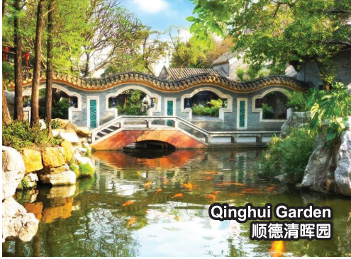
Qinghui Garden 顺德清晖园