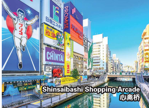
Shinsaibashi Shopping Arcade 心斎橋