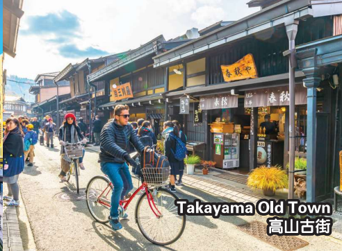
Takayama Old Town 高山古街