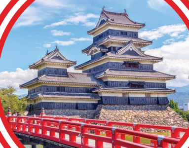
Matsumoto Castle 松本城