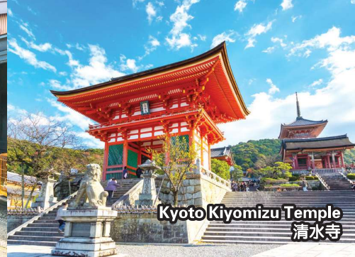
Kyoto Kiyomizu Temple 清水寺