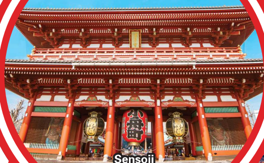
Sensoji (Asakusa Kannon Temple) 浅草雷门观音寺